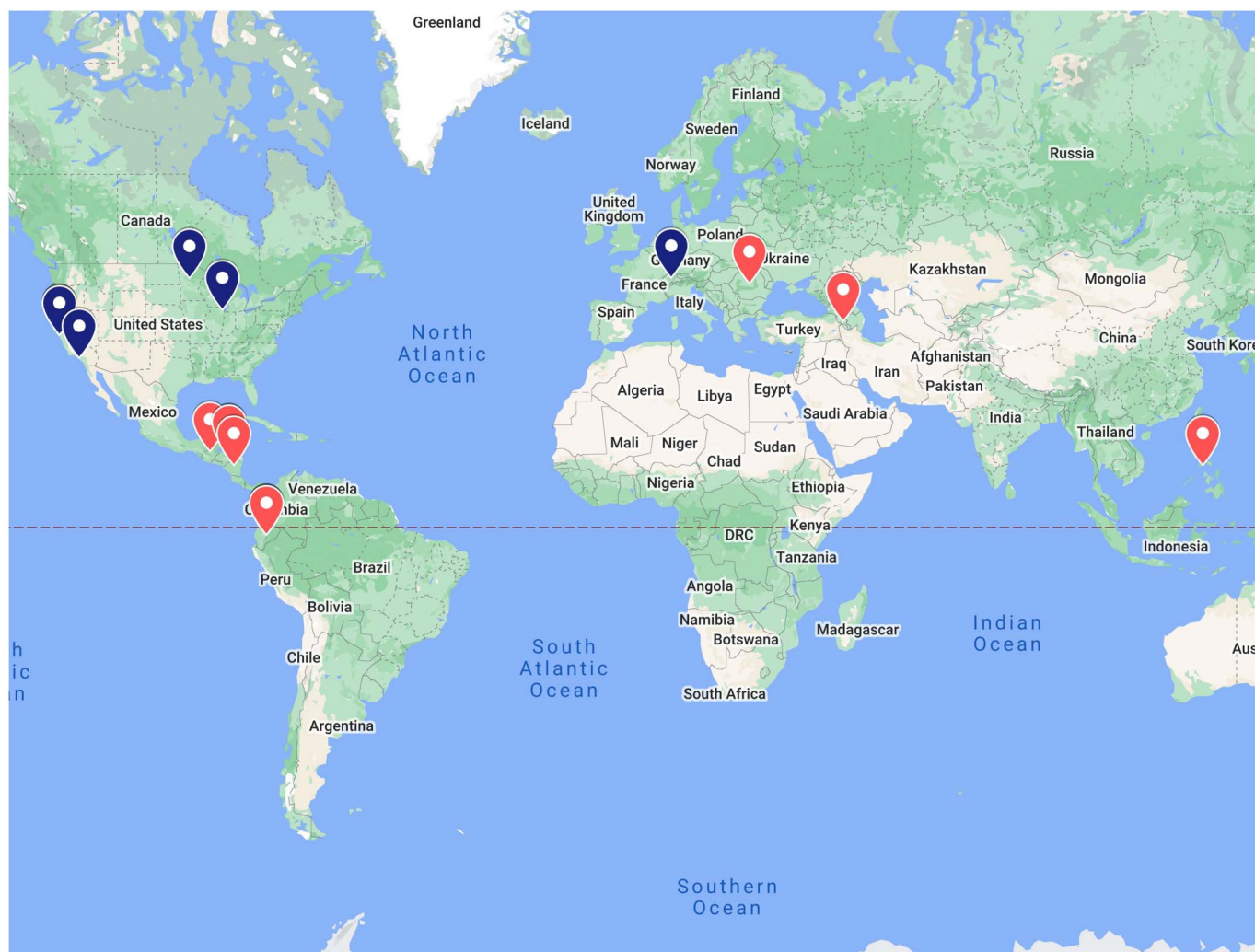
Fig. 1 Map displaying the home location of each respondent. The red pins signify respondents from LMICs ( n = 10 , representing 7 countries), and the blue pins signify respondents from HICs ( n = 7 , representing 2 countries).

Individuals who were \geq 18 years of age were identified by referral sampling and considered for inclusion in the study if they had experience working in international partnerships for implementing arthroscopy in an LMIC, whether the efforts were successful or not.