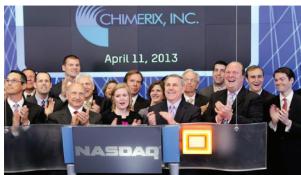
Chimerix rings the bell at NASDAQ.

BRINCIDOFOVIR IS A "PRODRUG," a weakened form of the antiviral cidofovir. It becomes fully active only when human