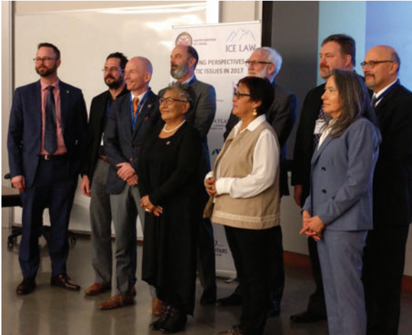
FIGURE 4: Initiating dialogue across the conceptual divide: a workshop that brought together Inuit speakers and participants from the maritime community (Ice Law Project 2017).

dependent on the absence of ice. The presence and constitution of ice only defines how space is used. Inuit conceive marine space always in connection to life and to events on land. The shores that define the Canadian Arctic archipelago are not the margins of the marine/land space; on the contrary, they are the connectors between marine and land realms within which people and animals share a living. Inuit worldviews, in this regard, challenge conventional understandings of chokepoints.