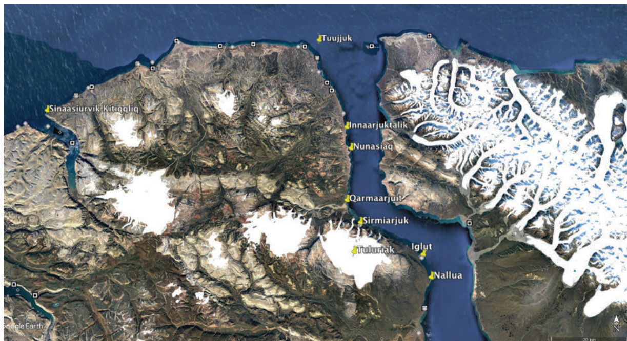
FIGURE 3: Selection of place names on the southern shore of Lancaster Sound. APORTA AND INUIT HERITAGE TRUST.

Marine salt-water spaces are defined less in terms of shoreline boundaries and more in relation to geophysical dynamics. While it is not uncommon for Inuit to name a stretch of sea in relation to a place name on shore (e.g., Salliarusiup Kangiqqlua refers to the Bay of Salliarusiup’s raised beaches), emphasis is placed on physical features relevant to mobility such as ice formation and breakup, currents, winds, topography of landfast ice, and presence and dynamics of open water. More than a bounded space open or closed to transit, for the Inuit the sea is a living environment in three significant ways: (a) it changes dramatically through the seasons; (b) it allows