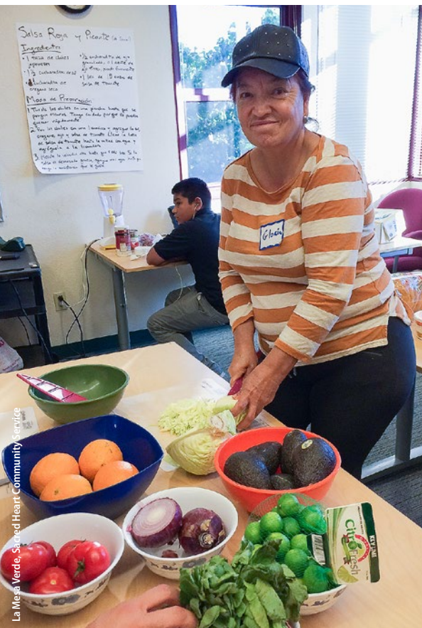
La Mesa Verde, Sacred Heart Community Service

In addition, we administered the same survey between September 2013 and April 2014 to 50 SNAP-eligible home gardeners participating in the LMV program. Interpreters helped translate the survey into Spanish or Chinese, and it was given to gardeners during community workshops. In total, just under 100 families were enrolled in the LMV program at the time of the survey. Open-ended