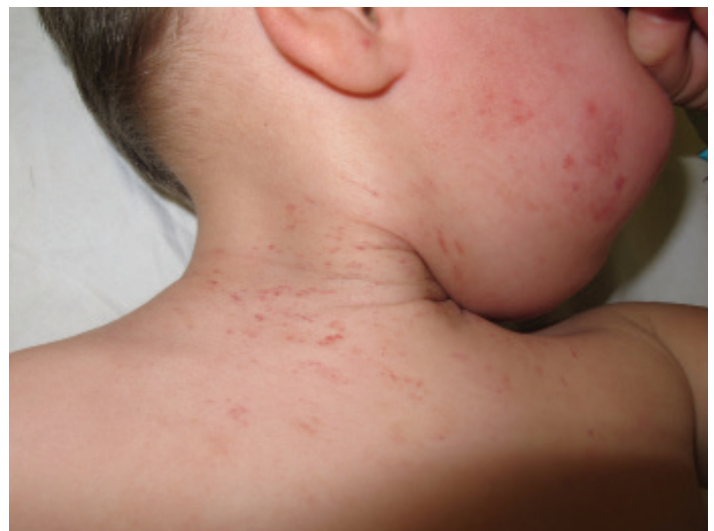
Figure 1. Linear telangiectasias on the cheeks, neck and upper part of the anterior chest.

On examination, we observed hundreds of small arborescent and linear telangiectasia on the cheeks, neck, and the upper part of the anterior chest ( Figure 1 ). On dermoscopy, fine, linear, irregular telangiectasia were seen ( Figure 2 ). There were no mucosal telangiectasia.