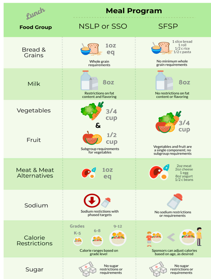
Figure A1. Meal pattern requirements † for meals served through the National School Lunch Program and Seamless Summer Option * compared to Summer Food Service Program. Adapted with permission from the Healthy Eating Research Strengthening the Impact of USDA’s Child Nutrition Summer Feeding Programs During and After the COVID-19 Pandemic brief [47]. Notes: * Sites serving meals using the Seamless Summer Option of the National School Lunch Program are traditionally required to adhere to the School Breakfast Program and National School Lunch Program meal pattern requirements. † Due to COVID, the US Department of Agriculture granted a nationwide waiver providing states the flexibility to serve meals that do not meet meal pattern requirements when needed [48].

SOURCE: NSLP participant and matched nonparticipant lunchtime dietary recall data from the School Nutrition and Meal Cost Study. Daily dietary intake recommendations from the 2015–2020 Dietary Guidelines for Americans, Appendix 7. Notes: NSLP: National School Lunch Program Asterisk (*) denotes statistically significant difference between National School Lunch Program participants and matched nonparticipants. a . Acceptable macronutrient distribution range, b . recommended dietary allowance; c . per 1000 kcal; d . tolerable upper intake level; e . adequate intake.