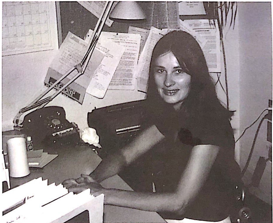
The author in her office in Campbell Hall, summer 1979.

These students had persuaded the department to offer a "women's course." Beginning in 1972, the caucus held meetings to choose the instructor for the new course. Each quarter, we sat on the floor of the comp lit library surrounded by stacks of books by women writers and our proposals.