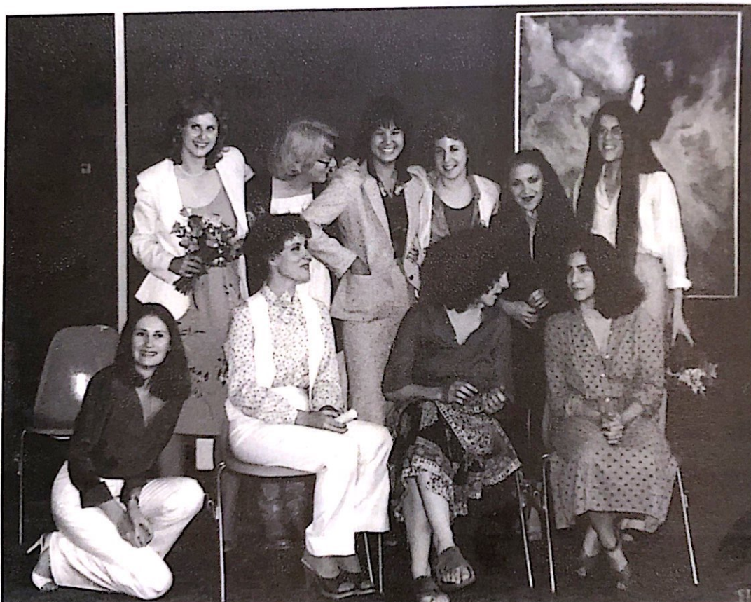
Women's Studies graduation, Haas Clubhouse, 1980.