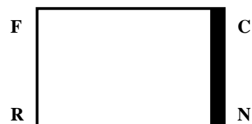
Figure 1: Room diagram with one blue wall (C=correct corner, R=reversal corner, N=near error, F=far error).

The experimenter recorded which corner the participant first indicated the target object was hidden as shown in figure 1 by coding it as either the correct corner (C), the rotational equivalent corner based on the shape of the room (R), the nearest error corner to the correct location (N), or the farthest error corner (F). To compare across all four search trials in each environment, we calculated for each participant a percentage of search trials at correct (C), geometrically appropriate (C+R), and landmark appropriate corners (C+N) according to Hermer-Vazquez et al. (1999). We initially compared the search rates to chance levels (chance = .25 for correct search; chance = .5 for geometrically appropriate, as well as landmark appropriate searches). We also performed ANOVAs to compare overall search performance between the three different environments, with follow-up contrasts on specific comparisons.