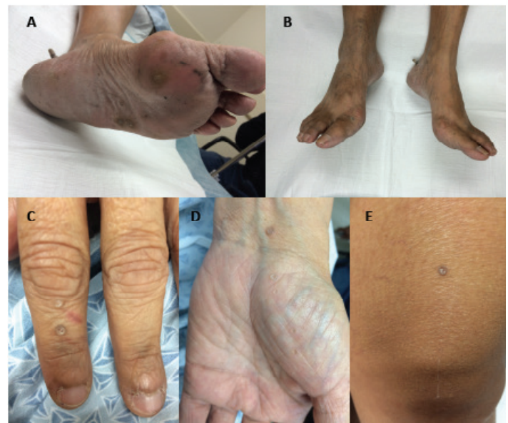
keratoderma on the following locations. 1A: Left Plantar Foot, 1B: Bilateral Dorsal Feet and Pretibial Areas, 1C: Left Dorsal Hand, 1D: Left Palm, 1E: Right Anterior Thigh.

A 53-year-old woman presented with a 13-year history of asymptomatic papules on hands, feet,