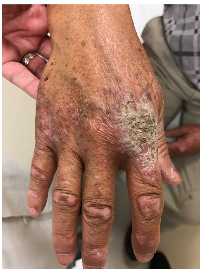
Figure 1. Second right dorsal metacarpophalangeal joint with 3. 5 x 3. 0 cm hyperkeratotic plaque.