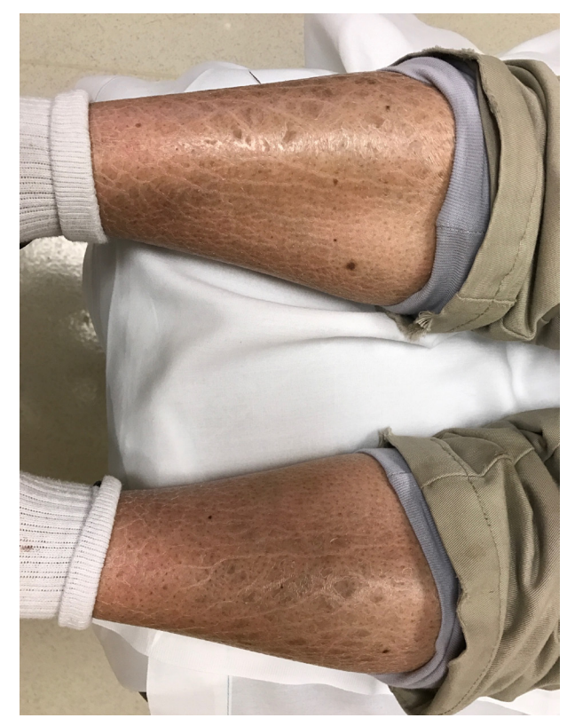
Figure 3. Bilateral anterior lower extremities. Ichthyosiform lesions present as plate-like scaling.