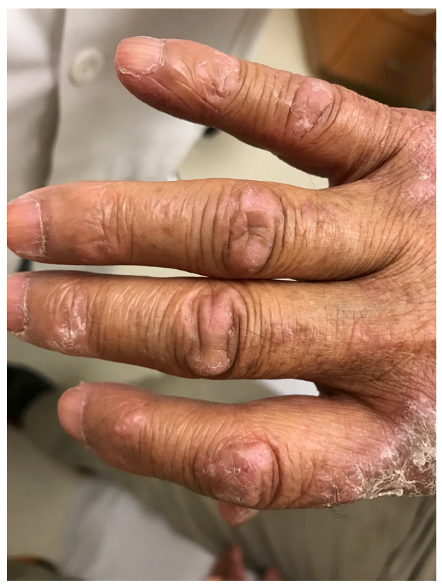
Figure 2. Dorsal proximal interphalangeal joints. All digits displayed dermatomyositis-like hypopigmented pink papules (Gottron's papules).

with 1500 mg, as well as phlebotomy every other month for hematocrit of greater than 45%. He also complained of a several year history of brown and tan spots distributed over his head, trunk, and extremities that worsened with sun exposure. A couple of years prior, he was found to have the JAK2 mutation, which is found in 95% of patients with PV and seen in other myeloproliferative neoplasms. The patient also had a history of coronary artery disease. Other medications included aspirin, atorvastatin, carvedilol, levothyroxine, multivitamins, magnesium, omeprazole, spironolactone, and tamsulosin. He denied a personal or family history of both skin cancer and ichthyosis vulgaris.