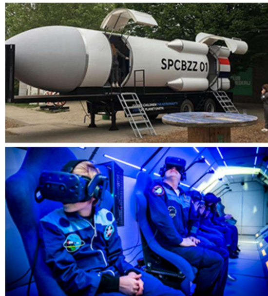
Figure 2: VR hardware