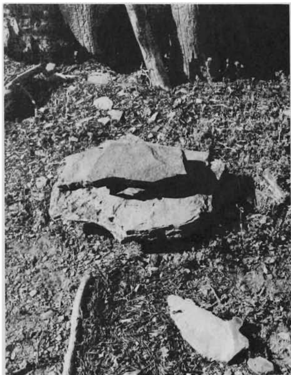
Fig. 2. Millingstone cache next to structure at Pinyon House site. Note glass bottle fragments to right of millingstones. The largest millingstone measures about 35 cm. in length.

Pinyon House site are a pair of birch ( Betula occidentalis ) poles, each about 3 m. long and 3 cm. in diameter. One of these, found resting in the crotch of a pinyon tree, is composite, consisting of a 1 m. distal element and a 2 m. proximal element lashed together with a leather thong; the other, found at the foot of the same tree, consists of a single limb. There can be little doubt that these are pinyon gathering poles, implements which frequently have a distal hook and are used in the harvest of pinyon cones (Steward 1933:242). Neither of the poles exhibits a distal crook, and no hooked examples were observed in the vicinity of the site.