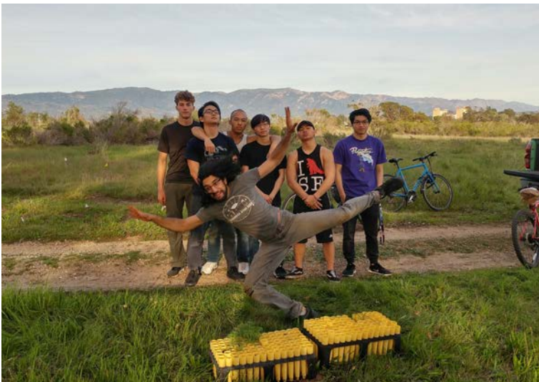
Breakdancers from UCSB Breakin' volunteered to plant native plants.

This year was a busy year for the stewardship program at COPR. We received almost 25 inches of rain, which is well above average. The increase in rainfall, meant that it was a great year for planting. We were able to plant over 2,000 plants as part of our efforts to restore native grassland and coastal scrub communities on the reserve. We received a tremendous amount of help with planting from several student and community groups, including the Environmental Affairs Board, UCSB ROTC, the Community Affairs Board, UCSB Wildlife Society, UCSB Breakin', and REI.