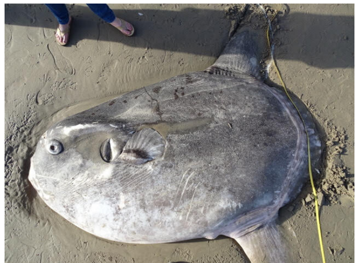
A Hoodwinker Sunfish, Mola tecta , was discovered washed ashore.