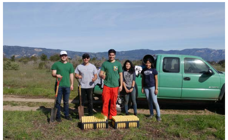
UCSB interns in the Land & Resource Stewardship program are funded by UCSB Coastal Fund.