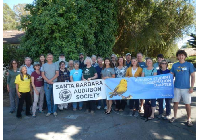
Audubon's Central Coast Council Meeting took place at the Nature Center in September 2019.