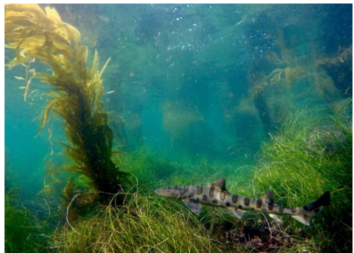
Undergraduate research on leopard shark diet was conducted at COPR.