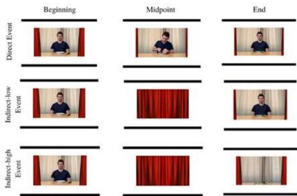
Figure 1. Snapshots of sample stimuli for Direct, Indirect-Low and Indirect-High Events.

Filler items consisted of 12 different videos of objects (e.g., pencils, cars) placed on a table in front of a plain wall. They were fully visible throughout the trial. The actor was not present in the videos. Participants were asked to identify the objects and answer a question about a property of the object (e.g., color, number, function). Filler trials were included to