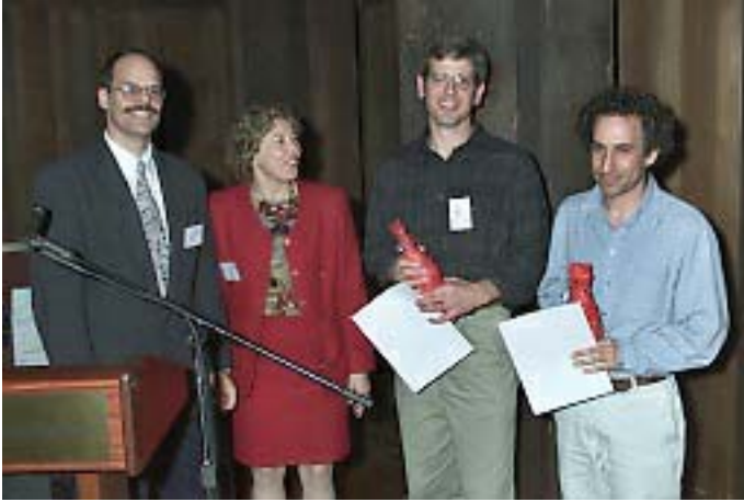
[figure 3 - XBD200010-01568-20.TIF]