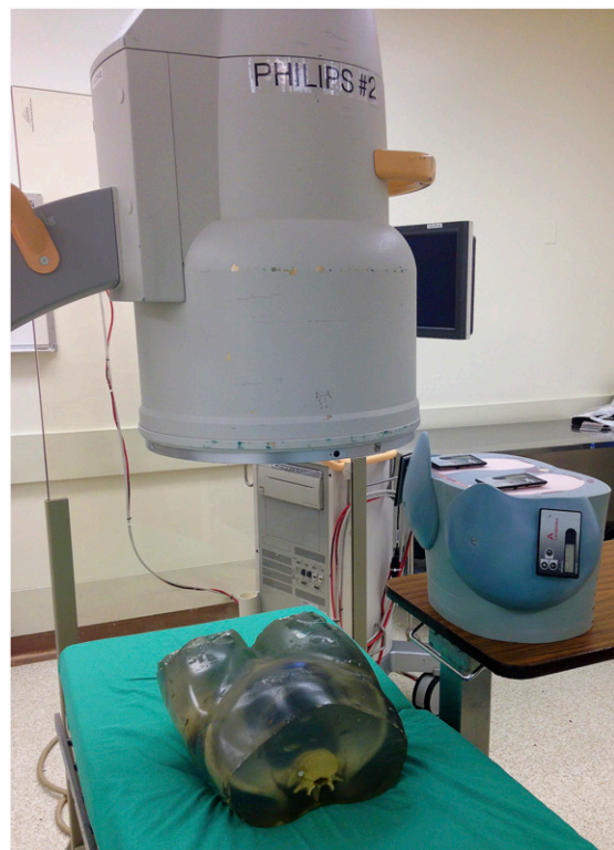
Fig. 1 The simulated operating-room configuration with anthropomorphic phantoms of the pelvis (to simulate the patient) and a female torso (to simulate the surgeon).

Anthropomorphic phantoms were used to simulate the surgeon and the patient in an operating-room setting. Both phantoms scatter ionizing radiation in an amount and direction comparable with that of human tissue. An anthropomorphic torso phantom (37-inch diameter) with 2 breast attachments (400 cc; size-C cup) (ATOM Dosimetry Phantom; CIRS) was placed adjacent to a standard operating table to simulate the orthopaedic surgeon. A second anthropomorphic phantom of a pelvis (ATOM Dosimetry Phantom) was placed on the operating table to simulate the patient (Fig. 1). The torso phantom was placed 25 cm from the pelvic phantom at a height corresponding to a surgeon height of 165 cm (modeled after the average height of U.S. women 20 to 70 years of age) 15 . The torso dimensions corresponded to a medium-sized apron/vest based on the manufacturer's (Infab) sizing chart. A mobile,