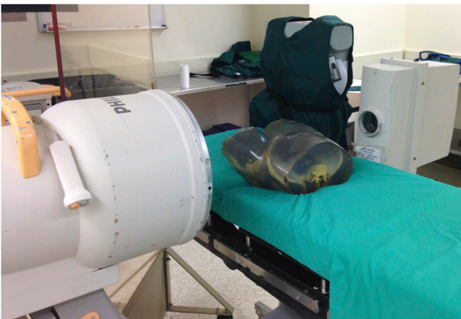
Fig. 5 The highest radiation doses to the left breast were observed in the C-arm cross-table lateral projection with the “surgeon” facing the table.

in the lateral position and with the torso facing the table (45.7 mrem/hr for no lead protection, 17.9 mrem/hr for vests, and 10.9 mrem/hr for cross-back aprons) ( p < 0.01 ) (Fig. 5). The highest dose-equivalent rate for the right-breast UOQ was observed with the C-arm in the lateral position and with the torso at 90^\circ (32.7 mrem/hr for no lead protection, 27.7 mrem/hr for vests, and 29.4 mrem/hr for cross-back aprons) ( p = 0.67 ) (Fig. 6).