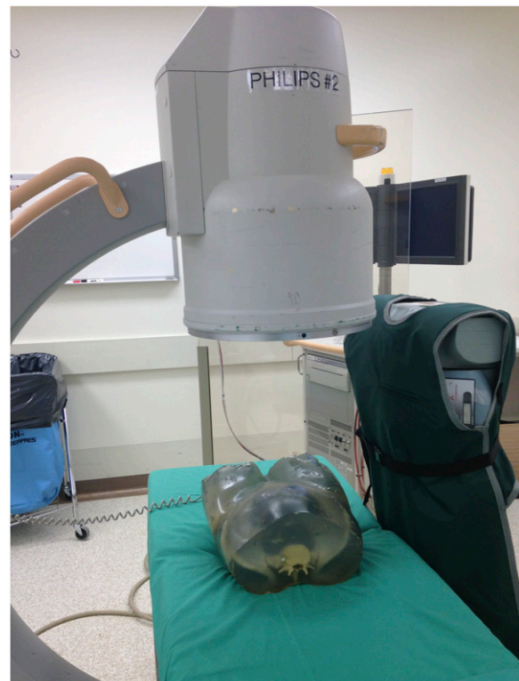
Fig. 3 Cross-back lead apron (large size shown here).

When comparing the C-arm positions across all apron types and sizes and surgeon positions, higher dose-equivalent rates were observed for both the UOQ and the LIQ in a C-arm lateral projection (0.98 mrem/hr) compared with an anteroposterior projection (0.13 mrem/hr) ( p < 0.001 ). The median dose-equivalent rate observed with the torso phantom facing the table (0.19 mrem/hr) was lower than that with the torso at 90° (0.40 mrem/hr) ( p = 0.13 ). The highest dose-equivalent rate for the left-breast UOQ was observed with the C-arm