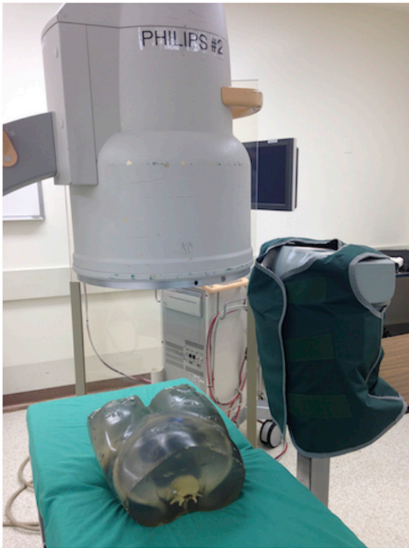
Fig. 4 Female vest (small size shown here).

in the lateral position and with the torso facing the table (45.7 mrem/hr for no lead protection, 17.9 mrem/hr for vests, and 10.9 mrem/hr for cross-back aprons) ( p < 0.01 ) (Fig. 5). The highest dose-equivalent rate for the right-breast UOQ was observed with the C-arm in the lateral position and with the torso at 90^\circ (32.7 mrem/hr for no lead protection, 27.7 mrem/hr for vests, and 29.4 mrem/hr for cross-back aprons) ( p = 0.67 ) (Fig. 6).