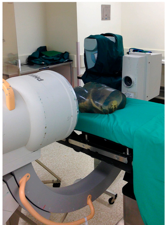
Fig. 6 The highest radiation doses to the right breast were observed in the C-arm cross-table lateral projection with the “surgeon” at 90^\circ to the table.

The median dose-equivalent rate of radiation to the UOQ observed for a medium-sized vest or apron, across all surgeon and C-arm positions, was 0.14 mrem/hr. Higher rates were observed for lead protection that was too small (size small, 0.18 mrem/hr) or too large (size extra-large, 0.37 mrem/hr), but these differences were not statistically significant. Larger aprons were more protective than small aprons in the C-arm anteroposterior projection and less protective in the C-arm lateral projection, although this was not statistically significant. The radiation dose-equivalent rates for male and female vests were not statistically significantly different.