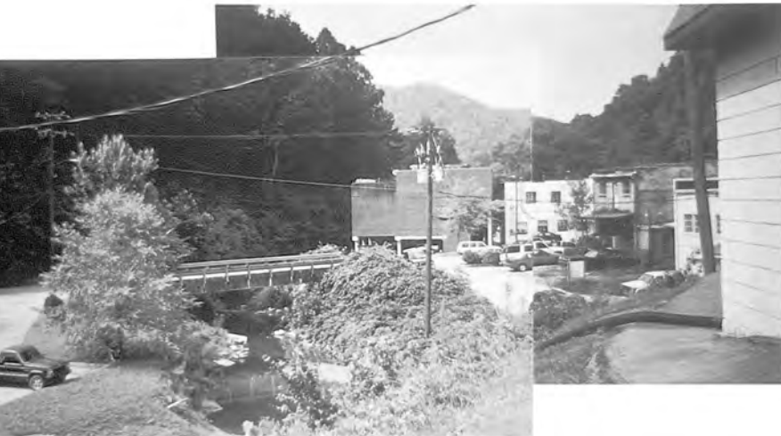
Above: The creekway behind Hindman's main street would become a string of open spaces and pedestrian connections Right: Main street.

form. It seeks to encourage growth in small steps that fit into the landscape, as well as into improved networks of streets, sidewalks and open space, reflect vernacular building patterns and makes the most of scarce opportunities.