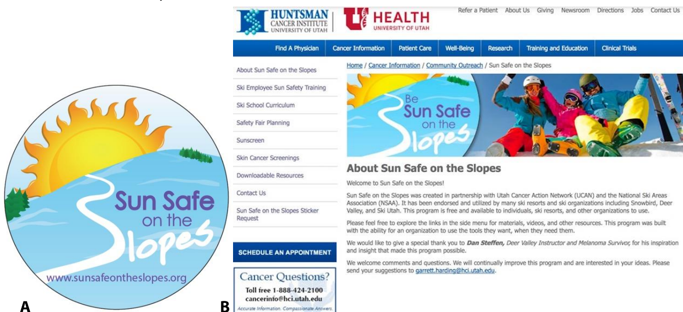
Figure 1. A) Final version of the “Sun Safe on the Slopes” logo with a website address. This was used on all educational and marketing materials and stickers were provided to ski resort employees and guests. B) “Sun Safe on the Slopes” educational homepage.

“Sun Safe on the Slopes” began in 2011 as a joint effort between two Utah ski resorts, Huntsman Cancer Institute (HCI) and the Department of Dermatology at the University of Utah (U of U), and the Utah Cancer Action Network (UCAN), a comprehensive cancer control coalition comprised of a diverse, professional group of stakeholders across the state. The goal was to provide comprehensive outreach, prevention education, and skin cancer screening to ski resort employees. Two