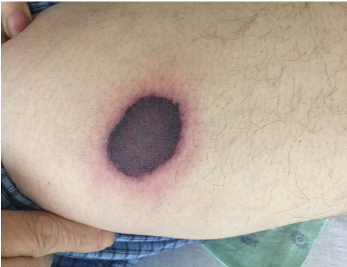
Figure 2. Violaceous circular patch with a halo of erythema on the right thigh.

secondary cutaneous hematogenously disseminated mucormycosis from a primary pulmonary source.