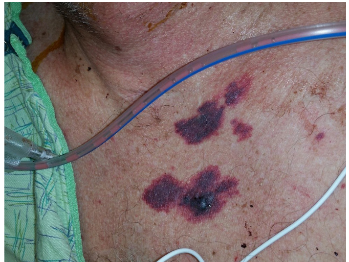
Figure 3. Purpuric patches with an erythematous halo on the chest with one patch demonstrating bulla formation due to necrosis.

circular patch with a halo of erythema on the right thigh ( Figure 2 ).