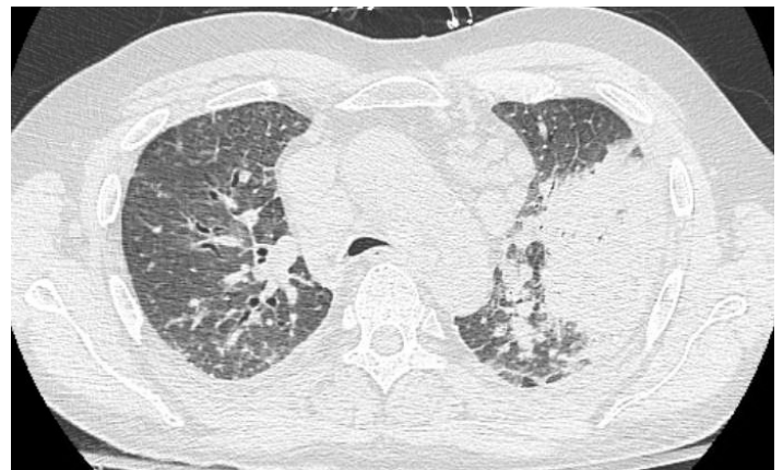
Figure 1. Bilateral lung opacities with associated lymphadenopathy seen on chest CT

Zygomycetes are found in decaying vegetation and soil and release a large number of spores [3]. Sources of infection include inhalation (most commonly), percutaneous inoculation, and ingestion of spores. Unlike other filamentous fungi, which more frequently disseminate hematogenously from other organs to skin, it is rare for systemic mucormycosis to spread to the skin [4]. According to a review by Roden et al., out of 220 patients with hematogenously disseminated infection, only 6 (3%) demonstrated secondary cutaneous involvement. Conversely, primary cutaneous infection had a 20% incidence of dissemination from skin to other organs. Additionally, mortality rates differ between localized cutaneous and disseminated infection at rates of 10% and 94%, respectively [4]. In an analysis of 25 patients seen at an institution, primary cutaneous mucormycosis had a much more favorable prognosis compared to disseminated disease from a non-cutaneous source of infection [5]. Herein, we present a patient with