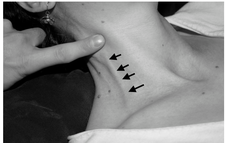
Figure 4. With the lower occlusion removed and the upper occlusion maintained, the external jugular vein fills from below, (as indicated by the arrows). The subject in the photo employed a Valsalva to stimulate a high CVP.

to partial occlusion of the vein by sclerotic valves that may prevent emptying.