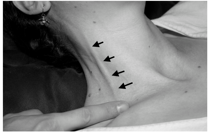
Figure 2. The external jugular vein is occluded at the clavicle and distends as it fills from above (indicated by the arrows).