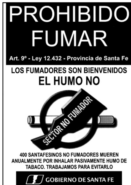
Figure 1 No smoking sign.