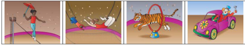
Fig. 1. Four-step practice sequence with “Circus” theme: walk a tightrope, swing on the trapeze, jump through the hoop, and drive the funny car.