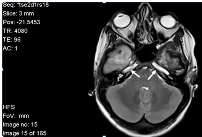
Image 3. Magnetic resonance angiogram showing absent signal flow in both internal carotid arteries (arrows), indicating occlusion.

infrequency of the disease combined with variability in manifestations and lack of specialized imaging in the ED. 4 Patient outcomes can be enhanced with prompt recognition and treatment. Generalized tonic-clonic seizures are present in 40% of those with CVT, as was the case in our patient. 1 Therefore, it is prudent for emergency physicians to include a CVT in the differential diagnosis of seizing patients, especially in all hypercoagulable states. This will improve recognition, allow the early initiation of treatment, and reduce morbidity and mortality. Other initial findings include headache (81%), limb weakness (34%), disturbed consciousness (30%), blurred vision (11%), and fever (6.9%). 1