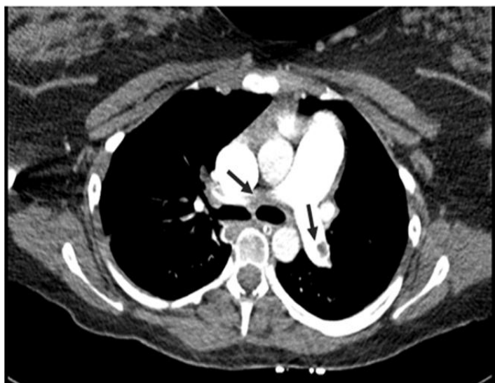
Image 2. Computed tomography pulmonary angiogram showing bilateral large filling defects involving the main pulmonary arteries (arrows).