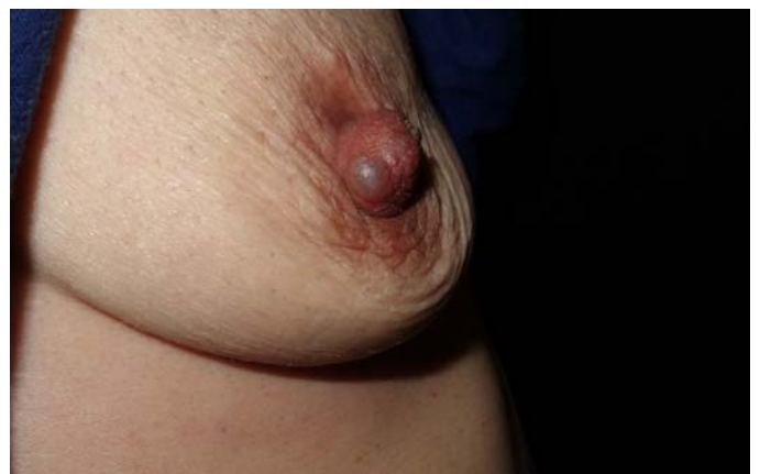
Figure 1. Smooth-surfaced, dome-shaped, translucent nodule on the left nipple.

Histopathologic examination revealed a cystic space in the subcutaneous layer with papillary projections into the cyst lumen. The epithelial lining of the cyst was composed of columnar cells that showed decapitation secretion, indicating the presence of apocrine secretion. These findings were consistent with apocrine hidrocystoma ( Figure 3 ).