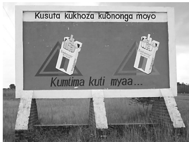
Figure 2 Mixed messages. “your heart is contented” (“Kumtima kuti myaa...”), and “Smoking may be harmful to your health” (“Kusuta kukhoza kuononga moyo”): British American Tobacco (BAT) advertisement for Embassy cigarettes, Lilongwe, Malawi, 2003. BAT used this ad as part of a larger marketing campaign to recruit new smokers during the same year that the company through the Eliminating Child Labour in Tobacco Growing Foundation (ECLT) claimed some success at reducing child labour in Malawi. 7 85 BAT aggressively markets cigarettes to women and children in Malawi to maintain and increase its market share (91%) of the local cigarette market. 97

BAT’s internal documents highlight that, rather than actively and responsibly working to solve the problem of child labour in growing tobacco, the company acted to co-opt the issue to present themselves over as a “socially responsible corporation” by releasing a policy statement claiming the company’s commitment to end harmful child labour practices, holding a global child labour conference with trade unions and other key stakeholders, and contributing nominal sums of money for development projects largely unrelated to efforts to end child labour.