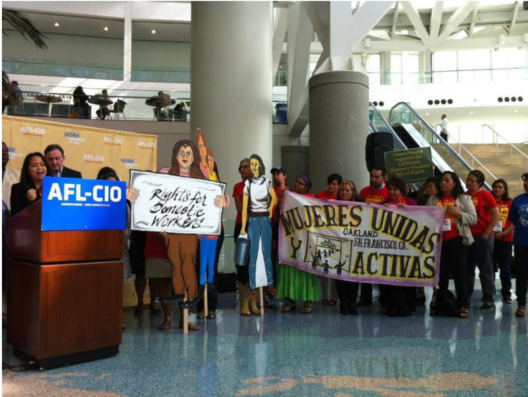
Domestic Workers and AFL-CIO hold a press conference celebrating lobbying and success of AB 241 at the California Legislature in Sacramento, CA October 12, 2013.