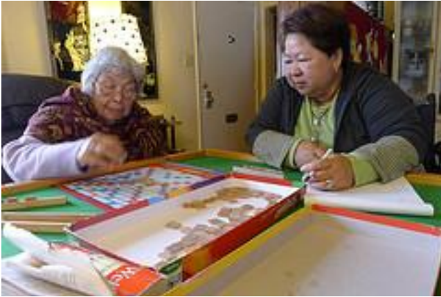
Domestic Care Worker providing crucial care work in the resident’s home.

includes domestic workers and personal attendants. The burden is on the employer to provide documentation and pay schedules. The Attorney General’s Office provides explicit requirements for the employer to adhere to as a preventative strategy, with enforcement options including civil penalties. 74