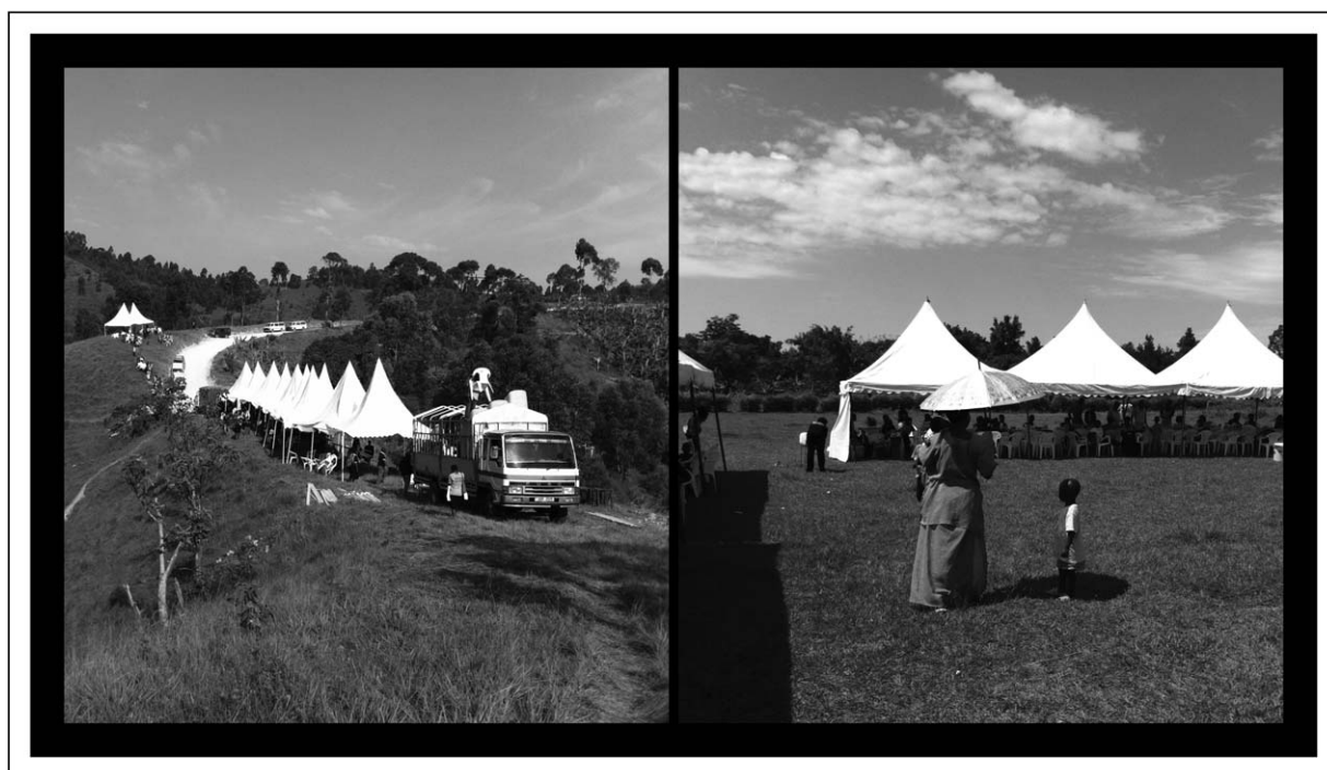
FIGURE 2. Photos of SEARCH Multidisease Community Health Fairs: (a) setting up health fair tents along a hilltop in Southwestern Uganda (photo to the left); and (b) a woman and her two children attending a health fair in Eastern Uganda (photo to the right). SEARCH, Sustainable East Africa Research in Community Health.

during testing to treatment transitions is higher – is critical to the success of UTT. During SEARCH health fairs, a healthcare worker (clinical officer or nurse) from the local government clinic and peer educators (PLHIV who volunteer at clinics) were in attendance, to ensure that each person diagnosed with HIV received an introduction to the clinic staff at the time of testing positive, and to assist with rapid linkage to care and ART initiation [10 ¶ ]. In keeping with the principle of nts with a positive screen for any condition, whether hypertension, diabetes or HIV, met with a staff member to receive a clinic appointment. At home visits, persons with a new HIV diagnosis talked with a clinic staff member via mobile phone to receive a welcoming introduction to the clinic.