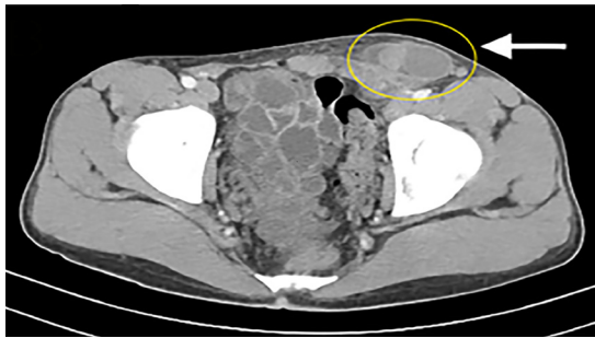
Image 1. Axial computed tomography at the lower margin of the pelvis with the cryptorchid testicle shown in the left inguinal canal (circle).