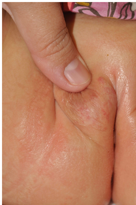
Figure 1c: Right labial hemangioma after five PDL treatments. Figure 1d: Right labial hemangioma (retracted) after five PDL treatments.