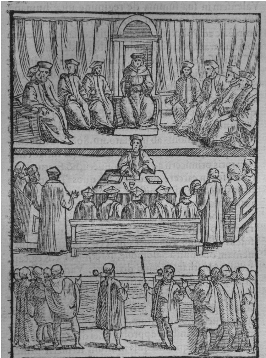
Illustration 4: Chasseneuz's Order of Offices 81