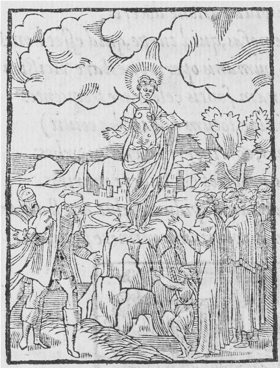
Illustration 1: Aneau's Image of Justice 29