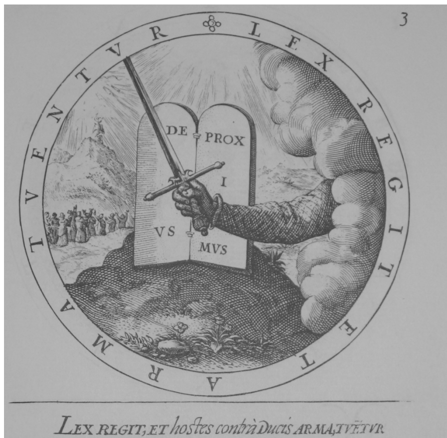
Illustration 2: Rollenhagen's Image of the Emergence of Law 32

The image is taken fairly directly from the story of the first law, the story of the Ten Commandments. In the foreground, fully frontal, held aloft by an arm appearing out of a cloud, is a sword, which, if the motto is to be believed, threatens execution and death— arma tuentur . Behind the sword is a tablet, a book of stone on which is inscribed, carefully placed around the arm and sword, so as to be fully visible, Deus proximus , God is at hand. The tablet, table, or tombstone of the law is placed on a pedestal of earth, while in the background, amidst claps of thunder, missiles of fire, and blinding light the people watch the moment of Moses returning with the law: “When God Almighty first engrav’d in stone / His holy Law; He did not give the same / As if some common Act had then beene done; / For, arm’d with Fires and Thunders , forth it came.” 33 And much more to