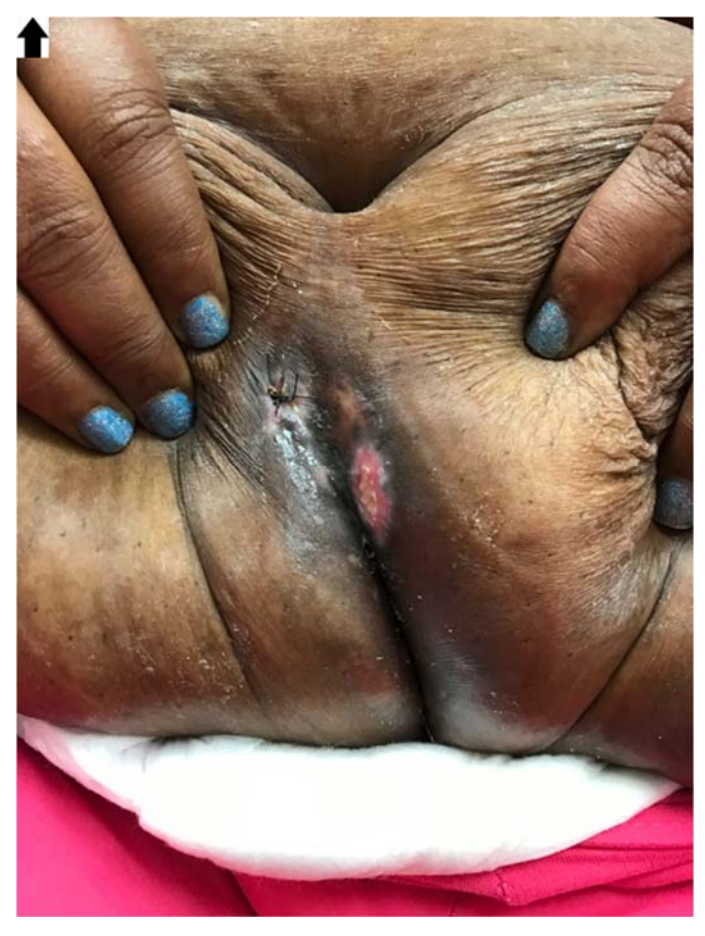
Figure 3 . Healing skin from the infrapannus fold two weeks following discontinuation of chemotherapy.

These findings are consistent with the histologic findings of the patient reported in our case. In addition to awareness of this condition and its association with certain chemotherapy agents, it is also essential to highlight the variety of treatment modalities for the cases that have been reported thus far. Toxic erythema of chemotherapy is a self-limited eruption after stopping chemotherapy and our patient showed significant resolution with