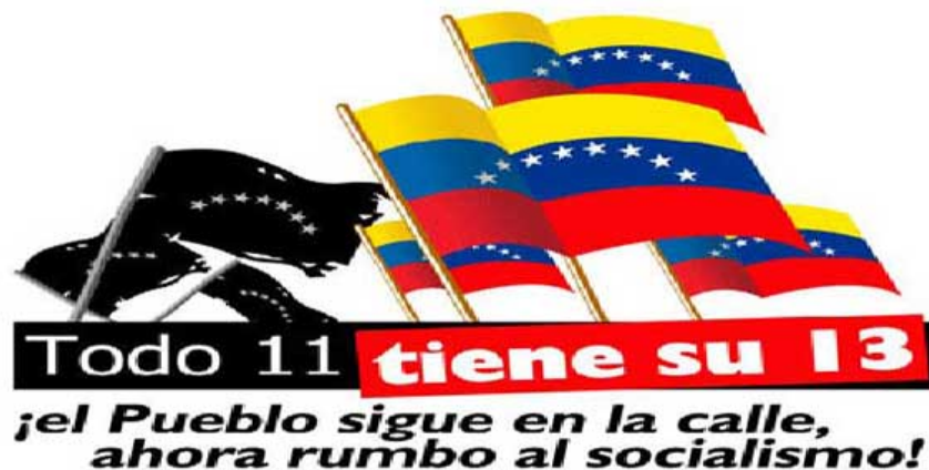
Figure 1.1 "Every 11th has its 13th: The Pueblo is still on the street, but today it's on the road to socialism!" (Source: http://aristobulo.psuv.org.ve/2011/04/11/%C2%A1uh-%C2%A1ah-chavez-no-se-va/que-el-mundo-lo-sepa-en-venezuela-todo-11-tendra-su-13 ).

A brief examination of some mass-produced and distributed popular iconography provides a telling glimpse into the importance of the events of April 2002 for the Bolivarian Revolution's discourse. The thirteenth of April not only reads as a defiant '¡no volverán!' ('they'll never come back') – a defensive and reactive posture that is perhaps predictable – it has also been invested with new layers of meaning, particularly in order to signify support for the forward march towards a presumably socialist future. This is evident not only in the speeches and celebrations that mark the anniversaries of the counter-coup, but also in the visual iconography of the Bolivarian Revolution on T-shirts, banners and impromptu murals (see figure 1).