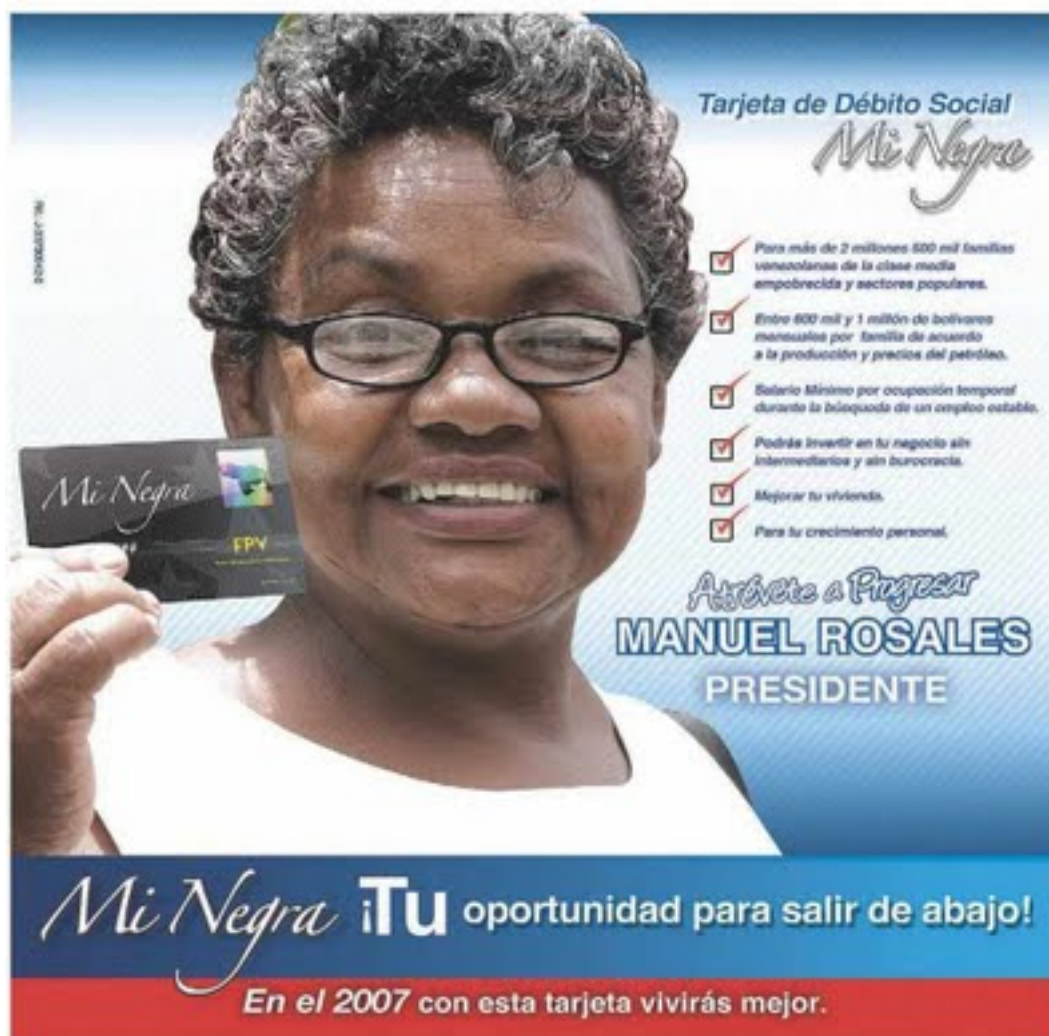
Figure 4.1: Advertisement of ‘Mi Negra’ Program (from the author’s files, 2007. Below the check-boxed statistical data, the slogans read, "Dare yourself and Progress [with] Manuel Rosales [for] President"; 'My Black: Your chance to leave the bottom'; 'With this card, you will live better in 2007.

Rosales articulated a scheme around the myth of Venezuelan oil in at least four registers. Firstly, it sought to raise support for the opposition in that they would ostensibly return to Venezuelans what was rightfully theirs in the first place: oil and the wealth it generates. Secondly, by using a personal debit card the mi negra program was built on entrepreneurial values, locating the proper agent of Venezuela’s future