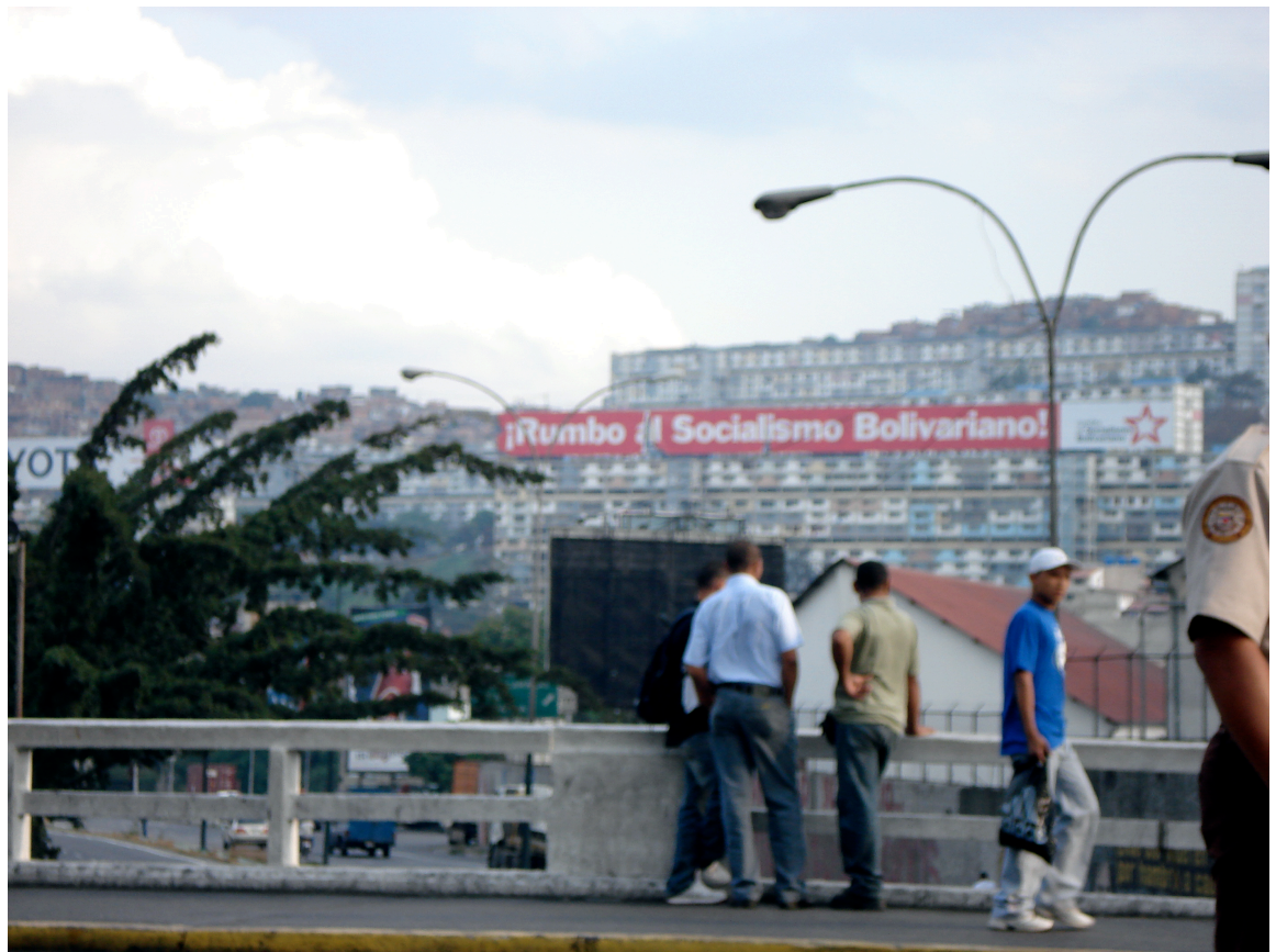
Figure 4.2 ¡Rumbo al Socialismo Bolivariano! photo by the author. The sign reads “On the path to Bolivarian Socialism.” The logo on the right features a five-pointed star with the five-steps slogan prominent at the time (2007).

Both statements attempt to give history lessons to passive observers and to interpellate subjects into a particular political trajectory. Both, in other words, attempt to articulate and reinforce their own substance to the myth of Bolívar. The billboard atop the 23 de Enero superblock rises above the city and the poor district with its chaos and poverty, a path the subject must look up and aspire to. The lettering is bold, both a triumphant exclamation and an exhortation to act.