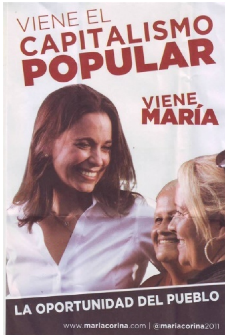
Figure 3.1 “Here comes the People’s Capitalism, Here comes María. Opportunity for the people. (Source: http://venezuelanalysis.com/analysis/6709 ). Note: in the original, the color of the bold slogan across the top – Viene el Capitalismo Popular, Viene María – is a red that closely approximates the red of official PSUV propaganda.

Throughout 2011 Machado, by then a deputy in the National Assembly representing some of the richest neighborhoods in the country, tried to position herself as a unity candidate against Chávez’s long-anticipated bid for a third term. Her campaign was in many ways shockingly honest – centering on the defense of capitalism and private