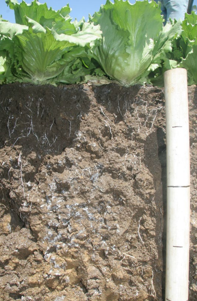
Figure 3. A mature iceberg lettuce crop may have roots below 2 feet of depth.

Example: How much soil moisture is available to an iceberg lettuce crop planted in clay loam soil?