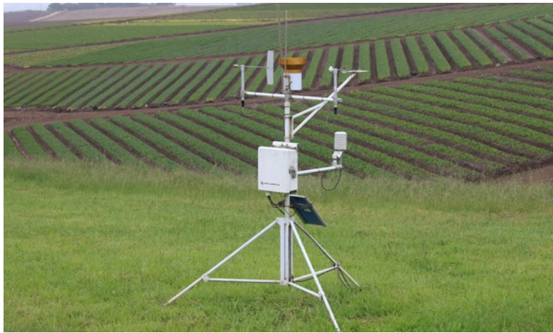
Figure 1. Weather station used to estimate reference evapotranspiration.

Potential crop ET depends on where and when a crop is grown, as well as on crop type. Reference ET values are available for most agricultural regions of the state on the website of the California Irrigation Management Information System (CIMIS) , an entity managed by the California Department of Water Resources. Reference ET values are derived from weather stations positioned