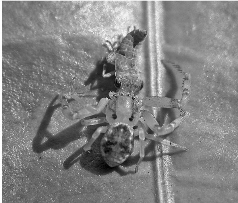
Figure 1. Predation attempt by the crab spider, M. melloleitao , on H. coagulata .

Araneidae), were conducted on Mo'orea and Tahiti in October 2003 and May 2004 (Table 1). Homalodisca coagulata nymphs and adults used in these trials were collected on these two islands both from ornamental plant species at coastal sites and from native and exotic vegetation at interior sites.