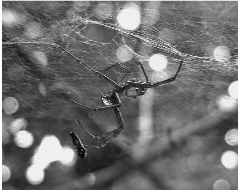
Figure 3. An intoxicated C. moluccensis , following predation on an adult H. coagulata . The spider has lost contact between several legs and its web structure and is secreting an unidentified amber fluid from its fangs.

after approximately two hours, its subsequent defensive behavior not discernibly different from the two C. moluccensis that exhibited no negative response to predation on H. coagulata or from others in the colony that had not fed on H. coagulata . After consuming flies, C. moluccensis exhibited no discernible change in vitality or defensive behavior. Overall, average consumption time by this species on H. coagulata was less than 25% the duration of feeding on flies ( t_{28} = 11.5 , P < 0.001 ) (Figure 2).