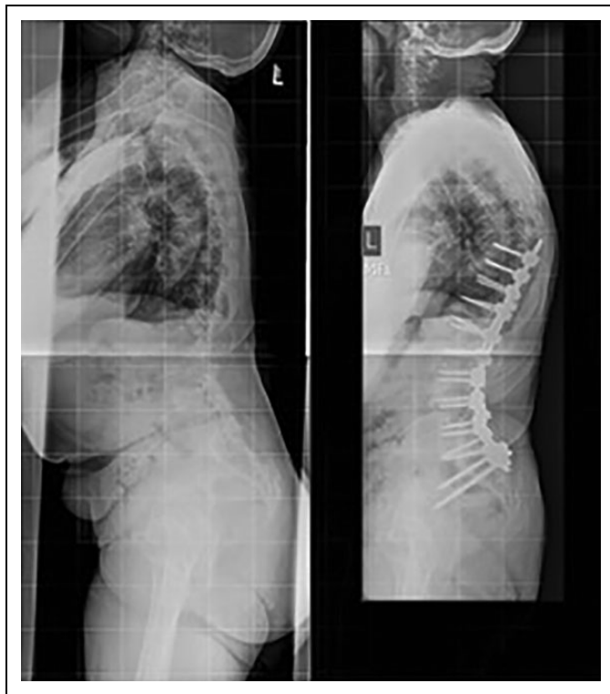
Figure 1. Preoperative and postoperative lateral radiographs of a patient from the HYB group who underwent T9-S1/pelvis reconstruction and incurred PJF.

however, was fixation failure/pseudarthrosis (Figure 2). Neurologic rationale for reoperation included 2 patients with motor and sensory deficit and 1 patient solely with radiculopathy in the HYB group, while there was only 1 patient with radiculopathy in the cMIS group.