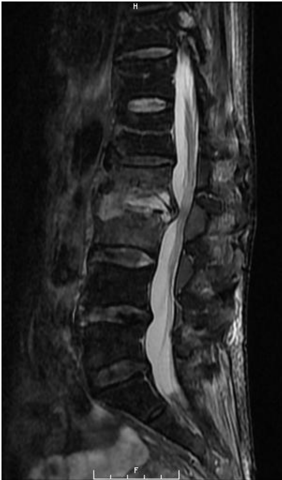
Figure 2. Sagittal T2-weighted MRI of the lumbar spine demonstrating L2–3 spondylodiscitis with moderate to severe spinal canal stenosis. Severe bone destruction was noted at L2.