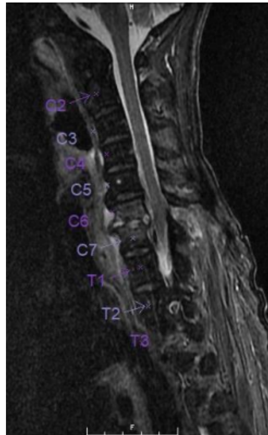
Figure 1. Sagittal T2-weighted MRI of the cervical spine spondylodiscitis at C6–C7 with retrovertebral epidural abscess. Bone edema at C6–7 is involving the entire motion segment.

course of intravenous antibiotics; however, her inflammatory markers remained persistently elevated. She had developed severe neck and lower back pain, which warranted a full spine MRI. Although she had antigravity strength in all four extremities, the degree of any neurologic deficits was difficult to assess due to her underlying psychiatric illness. Cervical spine MRI demonstrated spondylodiscitis at C6–7 with a prevertebral collection as well as a retrovertebral epidural abscess severely compressing the spinal cord (Fig. 1). There was no evidence of myelomalacia. Bone edema in both C6 and C7 vertebrae involved the entire motion segment. The combination of spondylodiscitis and epidural abscess resulted in a severe central canal stenosis and spinal cord compression. The lumbar spine MRI demonstrated L2–3 spondylodiscitis resulting in moderate-to-severe central canal stenosis with perivertebral extension. There also did appear to be infectious myositis of both the erector spinae musculature as well as bilateral iliopsoas. There was a right-sided iliopsoas abscess at the level of the L2–3 disc. There was also a severe