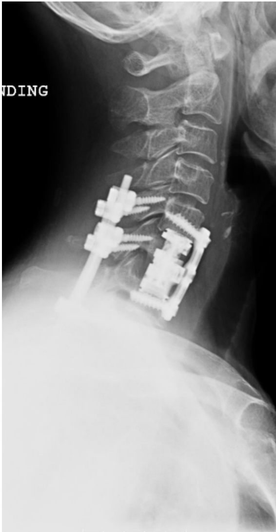
Figure 4. Postoperative lateral cervical spine X-ray depicting staged reconstruction following debridement and spondylectomy. Corpectomy defects were reconstructed with expandable cages. Stability was restored with lateral mass screws and pedicle screws across the cervicothoracic junction.

Certain characteristics on MR imaging may also predict the risk of multifocal spinal infections. The presence of osteomyelitis and paravertebral abscesses on imaging have been thought to be associated with both increased infection severity and multifocality. However, our study found no significant differences in the MRI characteristics between the unifocal and multifocal cohorts. In our study, the MR imaging suggested that the majority of multifocal spinal infection had a thoracic or cervical component. This is similar to a previous study by Abdelrahman et al. (2013) looking at 1138 consecutive cases of spondylitis and spondylodiscitis over 16 years. They reported that 6.8% of these cases showed additional non-contiguous sites of spinal infection and that the