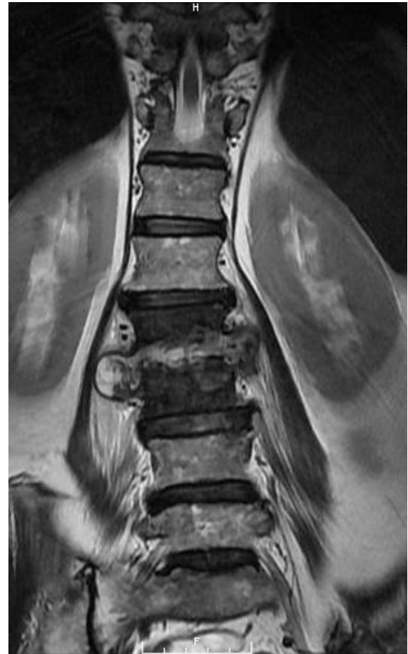
Figure 3. Coronal T2-weighted MRI of the lumbar spine demonstrating L2–3 spondylodiscitis with infectious myositis of the bilateral erector spinae musculature and iliopsoas musculature. A right iliopsoas abscess was also noted.

Therefore, we believe that obtaining an MR imaging of the entire spine as a screening tool in patients with a suspected spinal infection increases the yield of discovery of additional sites of infection. This may change the course of management from a medical to a surgical treatment strategy and result in the significantly decreased morbidity and mortality. This change in the treatment strategy with multifocal involvement is not dissimilar to polytrauma patients, when an otherwise non-operative spine fracture may become operative in the setting of accompanying extremity fractures (McLain and Benson, 1999).