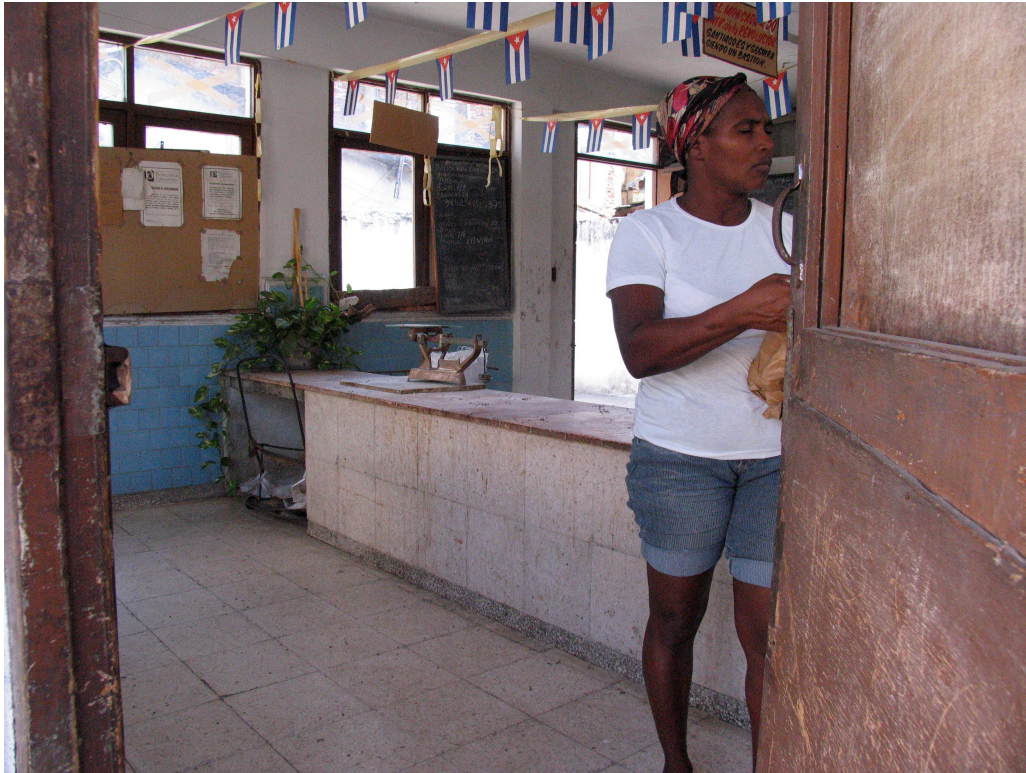
Figure 5: Typical Cuban Bodega

As of January 2012 the following products were available on the ration (per adult per month): Salt, five pounds of rice, 10 ounces of beans (the type of bean varies with availability, common types are: black, red and white beans), three pounds raw sugar and one pound refined sugar, 250 milliliters cooking oil, four ounces of coffee, and a roll of bread per day delivered to their house daily by the panadero . Babies up to age 3 years, 11 months, 29 days receive one twelve ounce can of fortified fruit puree compota per day, and from zero to seven years old all children receive one liter of powdered milk per day. Children from seven to fourteen years old receive one liter of soy yogurt per day. Around 2000 the Cuban state began allocating rice “ suplementos ” for people over 60 years old and “ adicional ” rice for children from zero to fourteen years old. There are also meat products in the ration; these are distributed at a carniceria . Each registered individual receives six ounces of chicken, six ounces of fish, and