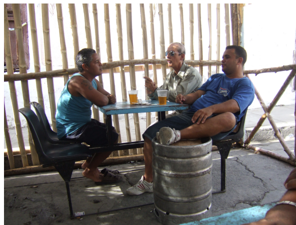
Figure 35: Carnaval Street Bar

Not only do people come from all over Cuba and the rest of the world to attend Carnaval , people from all over Cuba also come to work and sell food and other goods. For many food vendors from all over Cuba, the week of Carnaval is a time when they make their highest profits for the year.