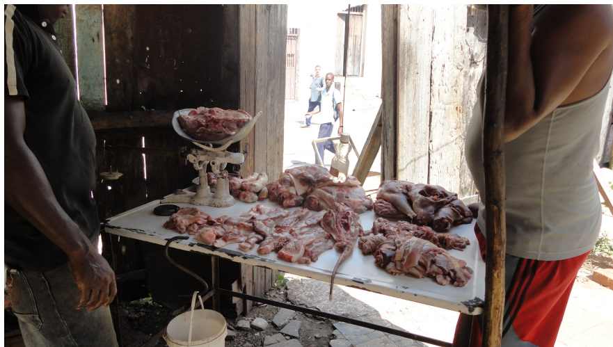
Figure 10: Small Neighborhood Butcher

On her way back home she stopped by her butcher friend's house to see if he had any scraps he would give her. Indeed he gave the leftover pieces of meat that were still on his cutting block to her, giving her just enough for flavoring and grease in her quimbombó .