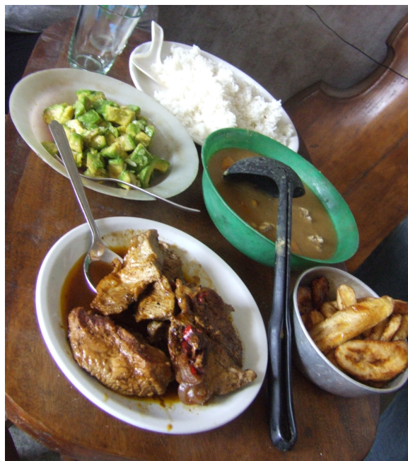
Figure 1: A Decent Cuban Meal