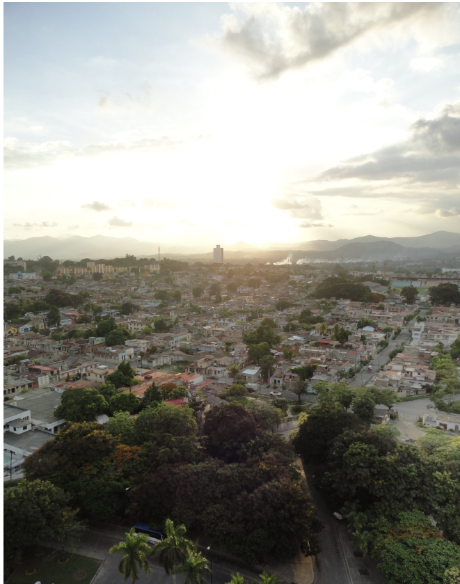
Figure 3: Panoramic View of Santiago de Cuba 2

Most of the households that I studied consisted of at least three generations, and some had up to five 8 . The oldest generation, la tercer edad “the third age,” was born in the years between 1910 and 1940, they ranged in age from 99 to 70 years at the time of the study. They remember Cuba as a relatively developed country with strong ties to the United States. They also