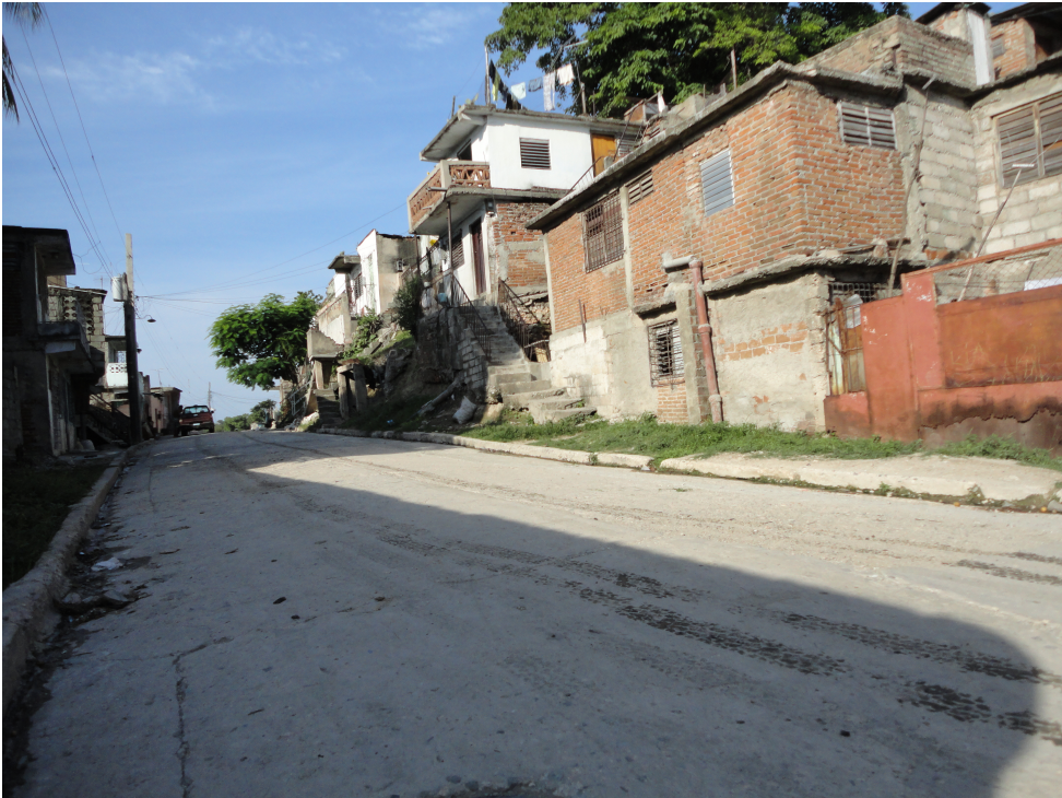
Figure 14: A Street in Deseý

In this chapter I address the ways in which the socialist food provisioning system has alleviated food-based inequality in some respects, and also reveal some areas where food inequality still exists or newly exists after the Special Period. Specifically I address food-related inequality across race, class, and neighborhood. Before delving into the data I outline the social and historical significance of skin color and class in the Caribbean in general and in Cuba specifically before and after the 1959 revolution. I then outline my data on the differences in food acquisition experiences across neighborhood, class, and skin color. I elaborate on the different ways in which families with difficulty acquiring food innovate strategies to acquire food across these social groups. Given that these strategies often include borrowing food or money from family and friends, this often further exacerbates inequalities between groups of