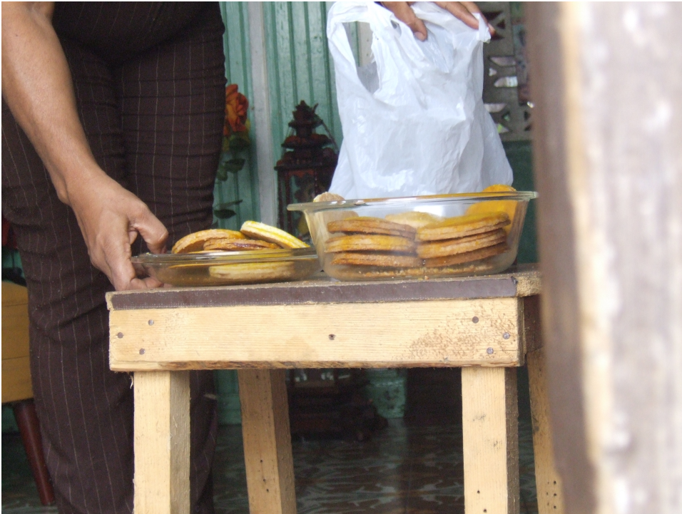
Figure 27: Sweets for Sale

My research participants viewed disease and weight gain as corporeal manifestations and material evidence of the effects of the poor Cuban diet. Over the course of my fieldwork in Santiago between 2008 and 2011, I noticed that people increasingly talked about wanting to lose weight. Whereas during my first few years of fieldwork in Santiago people were more likely to talk about a desire to gain weight, complain about not having enough food, or enviously compliment others who had more fat on their bodies. By the time I was wrapping up my fieldwork, it was rare to hear people express desires to gain weight and much more common for them to say they wanted to lose weight. Paradoxically, at the same time I had very clearly observed that it was becoming more and more difficult for people to acquire food. It was not clear to me why was there so much overweight in Santiago. In an interview Maria Julia clearly shared her perspective on the problem: