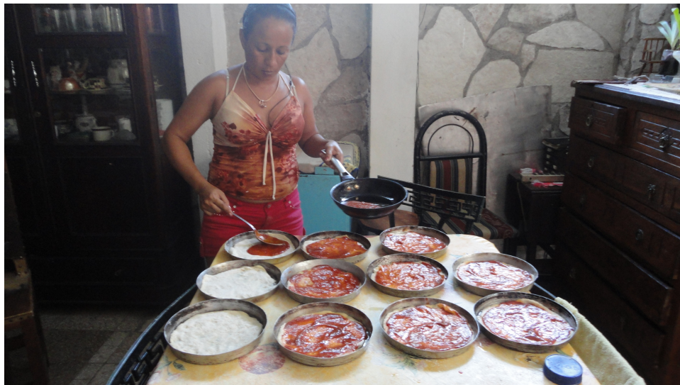
Figure 33: Homemade Pizzas

In Cuba, the state monitors and controls many aspects of the body related to health, but weight and body shape are among the few aspects of the Cuban body that are not regulated or monitored by the state; they are still regulated socially by cultural and social norms for appearance. Both the body and subjectivity are manifestations of relations of power or subjugation (cf. Mattingly 2010). Thus through an analysis of individual level bodily practices of