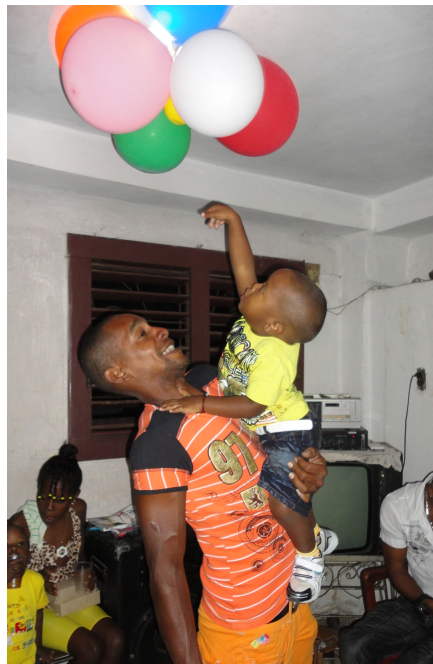
Figure 37: The Birthday Boy

Children's birthday parties are often very expensive for Santiago families, and many households spend months saving by working extra hours to pay for them. Despite the high costs, Santiago families almost always find a way to host a birthday party; often families go into debt to pay for children's birthday parties. Such parties are important social events that serve as a form of reciprocal gifting, as each child that hosts a party can expect to be invited to the parties