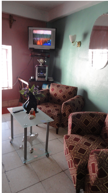
Figure 24: An “Orderly” Home