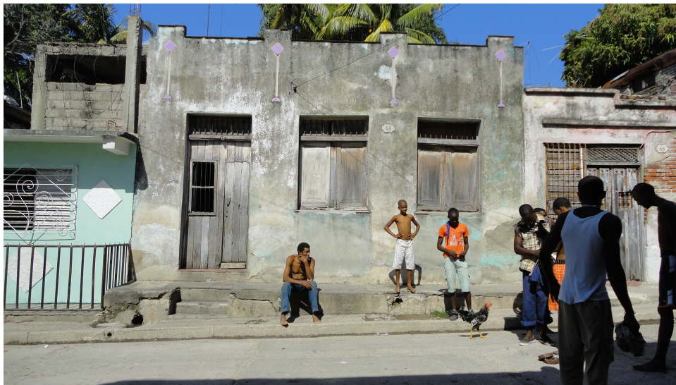
Figure 23: A Street Cockfight

Indeed she is one of the only participants in my study who had repeatedly had opportunities to leave the island and live a much more economically comfortable life but she stressed to me that she chose to come back to Cuba every time because she loves her country and loves her way of life.