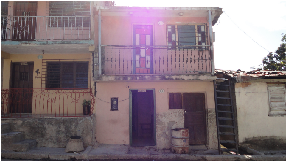
Figure 18: Houses in Chicharrones