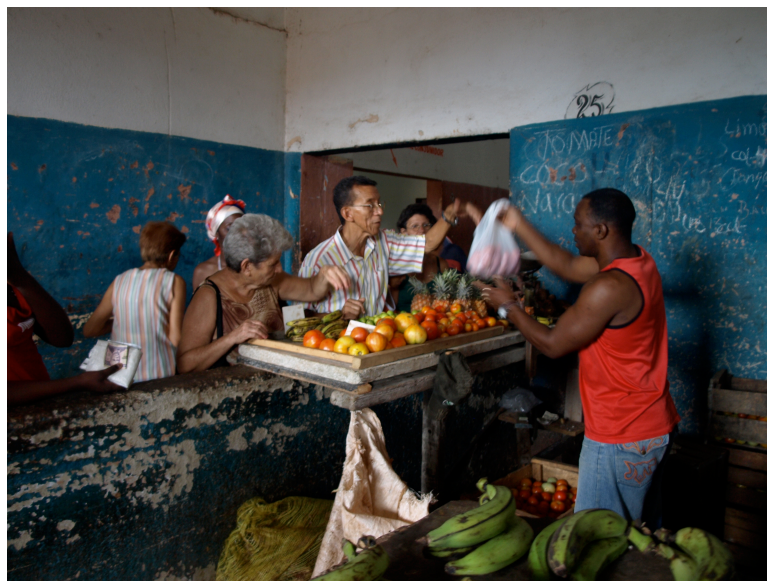
Figure 8: Food Stalls in La Plaza

She clutched her canvas bag to her chest as she walked past counter after counter of under-ripe tomatoes. She was not interested in tomatoes—it would take far too many to make enough sauce. She stopped in front of one stall that had plantains—she didn't have any oil for tostones , but she could boil them to make fufú de plátano , a traditional dish made by mashing boiled plantains with pork fat, garnished with fried pork skin. Keeping the plantains in mind she moved into the next room where there were more stalls with more variety of food. She paused to examine the okra, noting the price at the first stall—was it cheaper than in her neighborhood? She remembered it being the same price there, but she knew that she could get the man working at her neighborhood market to throw in a few pieces for free. They wouldn't do this for her here—they didn't know her and wouldn't favor her because of her dark skin 18 . She decided to just pick up a few onions and cooking peppers at the Plaza, and she would walk back to her neighborhood to get quimbombó (okra) and hoped she would get a few extras thrown in for free.