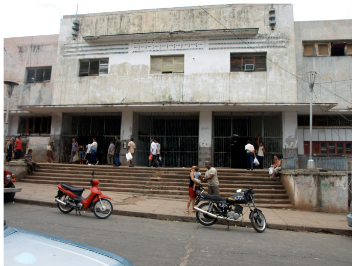
Figure 7: Mercado La Plaza, Santiago de Cuba