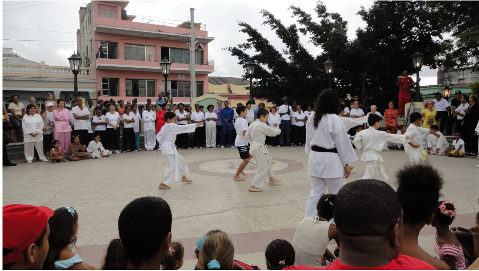
Figure 32: Martial Arts

dieting participants focused on exercise do not appear to make the same connections between exercise and memories of the special period even though increased physical activity was obligatory due to decreased availability of transportation.