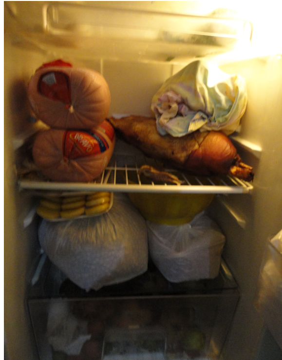
Figure 11: Processed Meats

As with general food inaccessibility and the lack of access to culturally appropriate foods (cf. Garth 2012), concerns over food safety also created a genuine sense of panic among research participants. Here again there is a clear sense of inescapable subjection to the state's unclear and mistrusted food distribution system. Families feel that they are stuck with unsafe, unreliable food provided by the state; many feel they must consume this food as it is the only financially viable option, but fear that the food will make them sick and strongly dislike the taste.