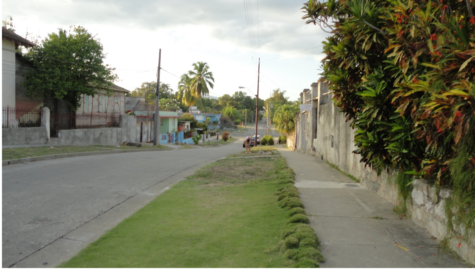
Figure 17: A House in Vista Alegre