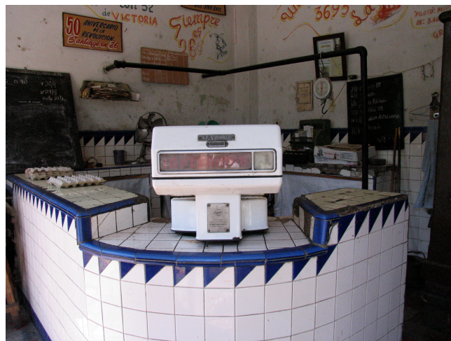
Figure 4: A Typical Cuban Carniceria

Cecelia, a 54 year old, middle class, white Santiaguera, works as a bodegera —the person who runs the ration station where dry goods are distributed, known as the bodega . Cecelia is a beloved member of her community who has worked in the same bodega for nearly 30 years. Bodegas (and carnicerías—where meat rations are picked up) are interspersed every few blocks throughout Santiago neighborhoods and service the families in the immediate area. Those who receive their rations at Cecelia’s bodega view her as someone that is on their side, helping them out as much as she can within the limitations that the state puts on her and the supply of ration food.