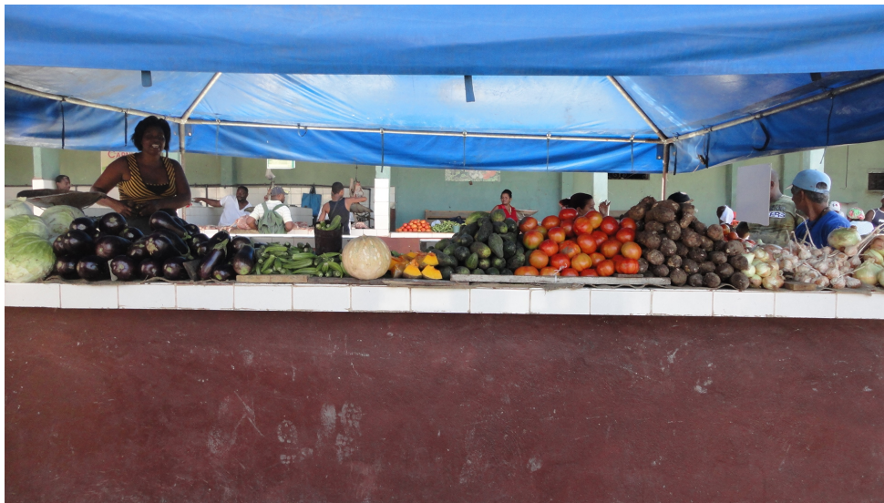
Figure 13: Trocha y Cristina Market