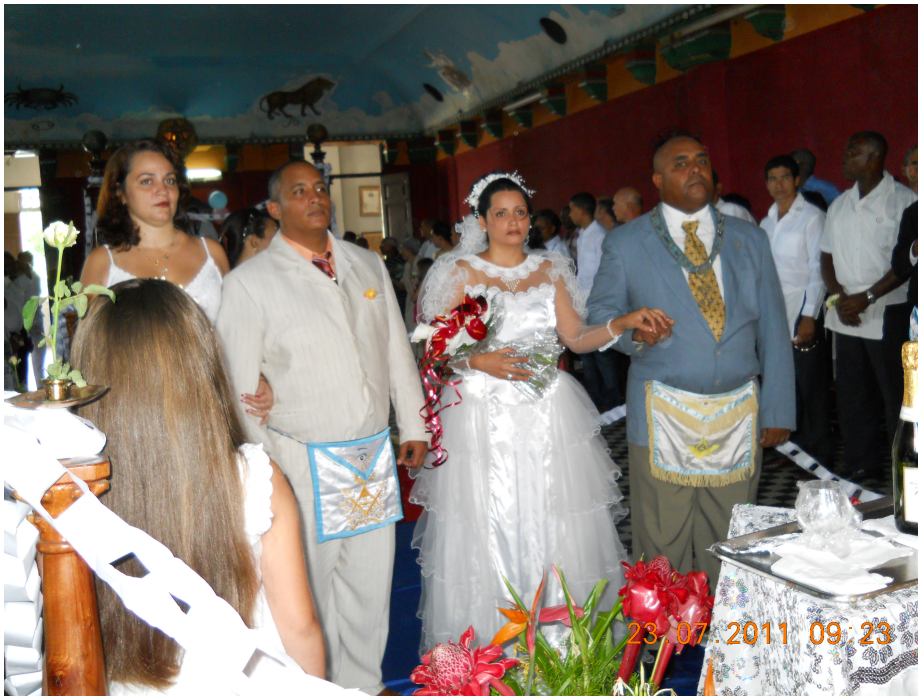
Figure 26: A Wedding at the Masonic Lodge