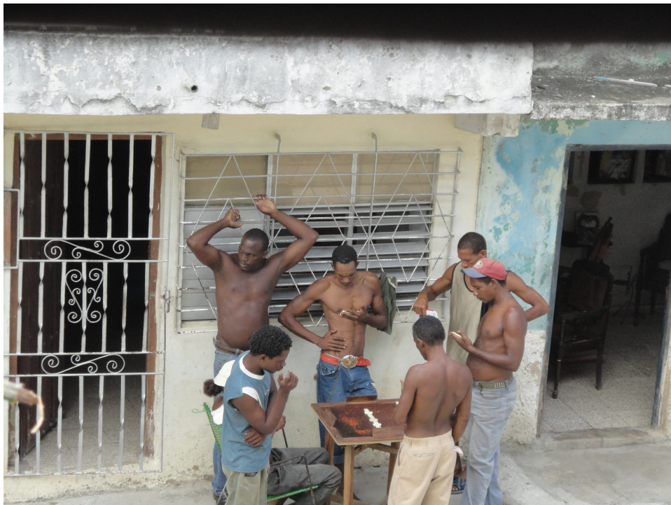
Figure 20: Men In the Street

While it is true that some men appear to be taking on more household-based labor than previous generations, this is often a sensitive topic in that it is still not socially accepted. Mickey, like Berto, underestimates the amount of work that Cuban women still must undertake despite the fact that increasingly men and children help out with small household tasks.