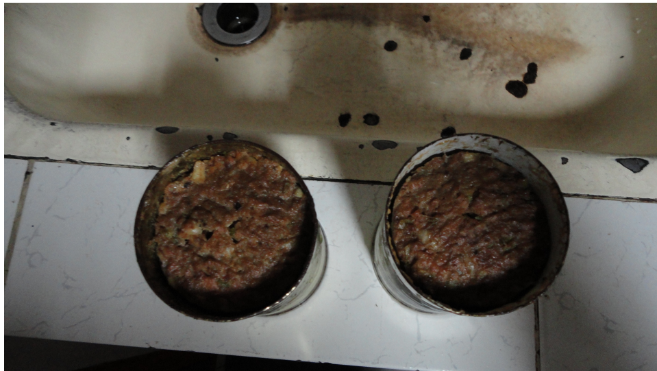
Figure 22: JC's Meat Loaf

On this particular day, he acquired some low quality beef and decided to grind it up and make meat loaf ( carne prensada ), he added some pork to the beef and ground them together. He turned on the radio and listened to the late afternoon programming as he ground the meat. Once the meat was ground he rummaged through some big mesh bags next to the refrigerator that held plastic bottles, jars, cans, and other things they thought might come in handy. He found an aluminum can that was the right size for the meat loaf and rinsed it. He filled the rice cooker with water and set it to cook. I must have looked puzzled, for he offered up that he was heating water