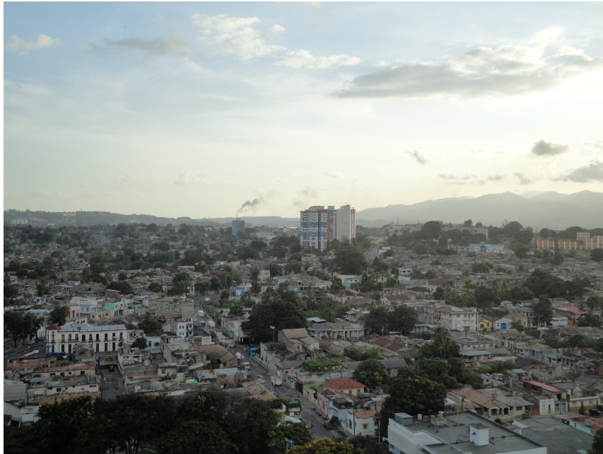
Figure 2: Panoramic View of Santiago de Cuba 1

This study consisted of 16 months of fieldwork between July 2008 and September 2011. This included preliminary research during the summer months in 2008 and 2009, 3 months of dissertation research during the summer of 2010 and 9 consecutive months from January 2011 to September 2011. Twenty-two households officially participated in the study, which included a total of 107 household members. In order to be included in the study households had to have at least two members who were of working age in Cuba (18-60 years of age) and at least one other household member. Children were not interviewed but were part of all other aspects of the research. I chose to use more in depth, intensive methods with fewer families in order to gain an understanding of the complexities and paradoxes of daily life from research participants' perspectives. My research provides critical insight into everyday life, as this type of in depth analysis of household life has not been systematically done in an anthropological study of Cuban life. Although I privileged depth of information, by virtue of the fact that Cuban households tend to be quite large I was still able to study over 100 individuals over the course of the time that I