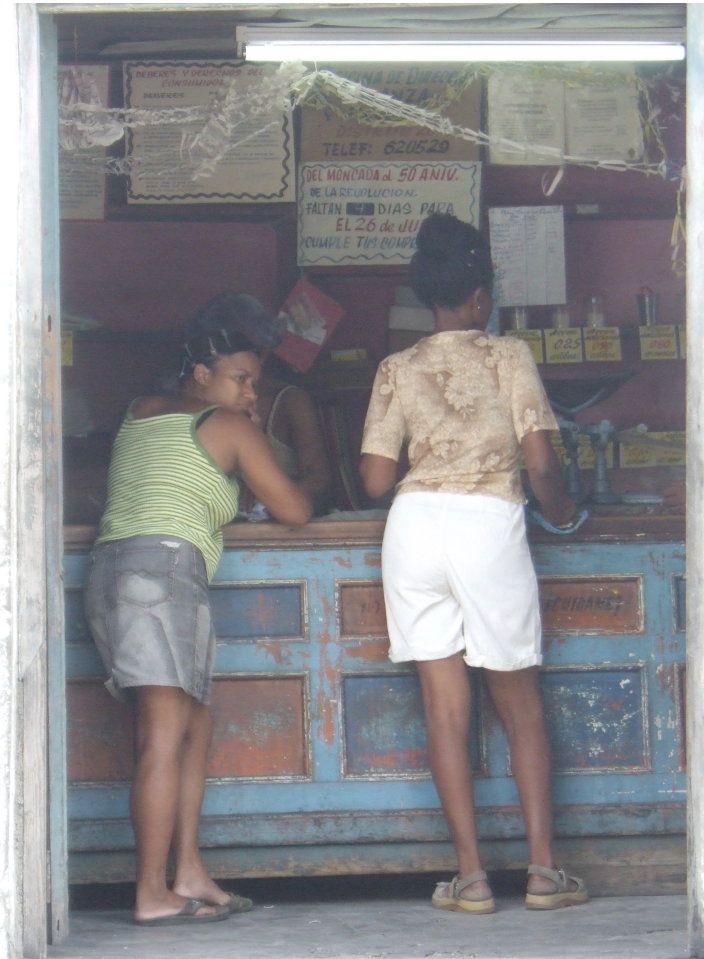
Figure 19: Women Collecting Rations

Her reflections illuminate the larger point that women have historically taken on the dual burden of housework and plus work outside the home. In her case, she continues to take on this labor, caring for the children so that their mothers have less of a work burden. In my study population it is very common for grandmothers to care for grandchildren to alleviate some stress from their daughters lives.