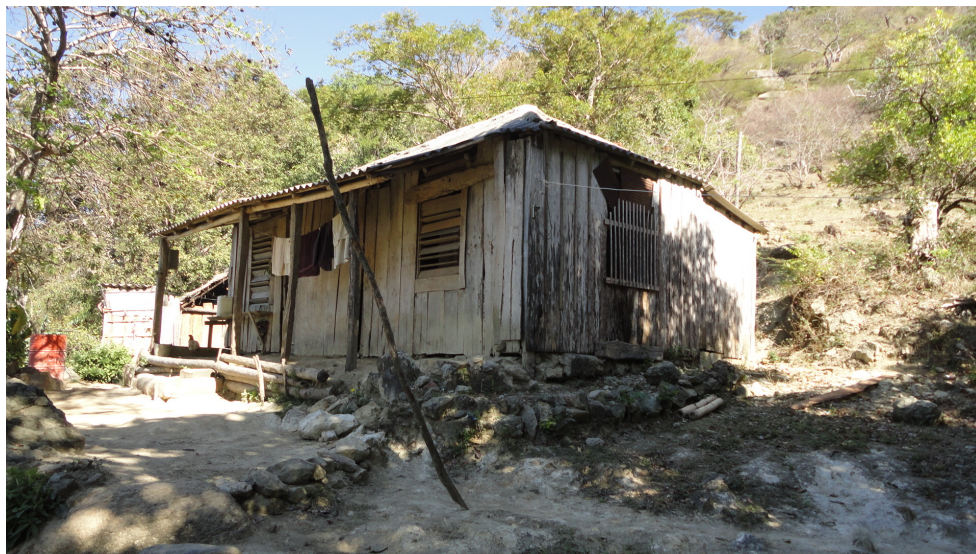
Figure 15: A House in El Monte

El Monte is resource poor with respect to the comforts of city life, such as processed foods like cooking oil, soda, or candy. It is located an hour's ride from the nearest stores, thus many families do not have as much clothing or other household items as a city family might have. On the other hand these families are wealthy with respect to food access. They are able to access fresh milk and dairy projects, fresh meat, vegetables and fruit all right there in their area. Other food items however are scarce in this area and families must go to the city to acquire them, these items include cooking oil, pasta and other processed foods, coffee, sugar, flour, etc. In many ways they experience the opposite difficulties of the urban families in my study that more easily acquire processed foods and staples and have difficulty supplementing those items with things like meat, dairy, and fresh produce.