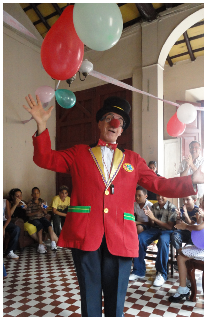
Figure 36: Child's Birthday Party Clown

Children's parties are much more elaborate than those of adults. It is typical for parents to invite all of the neighborhood children regardless of age to their child's party; it is not uncommon for a child's birthday party to have 50 to 100 guests. Usually gift bags with a small toy, candy, and other trinkets are provided for each child guest. Typically ensalada fria