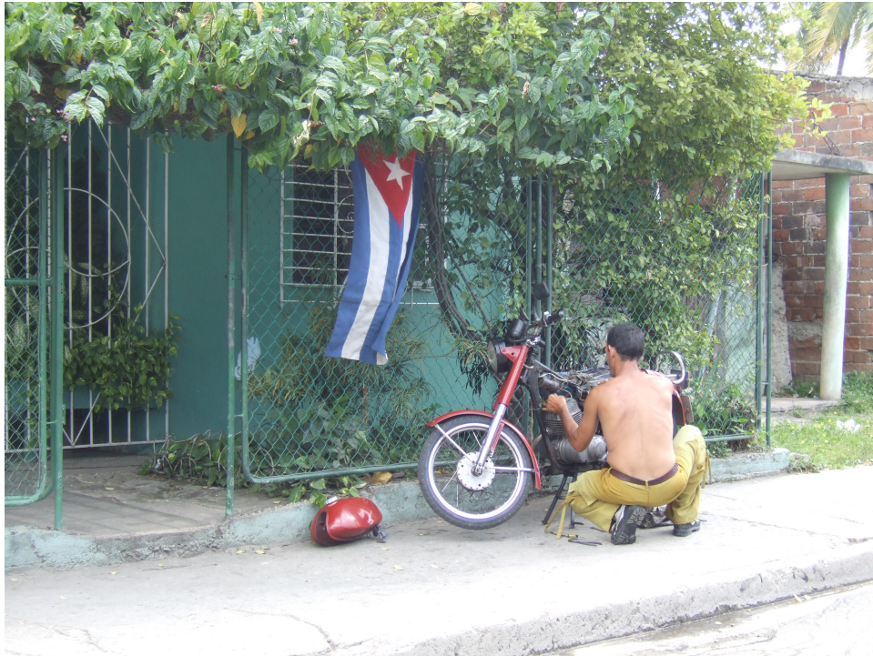
Figure 21: Man Repairing Motorcycle