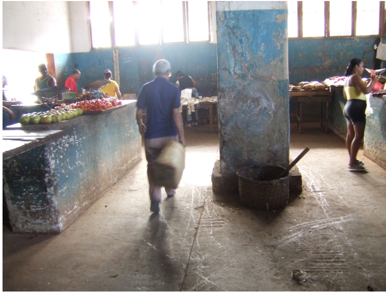
Figure 9: Food Stalls in La Plaza 2

On her way back home she stopped by her butcher friend's house to see if he had any scraps he would give her. Indeed he gave the leftover pieces of meat that were still on his cutting block to her, giving her just enough for flavoring and grease in her quimbombó .