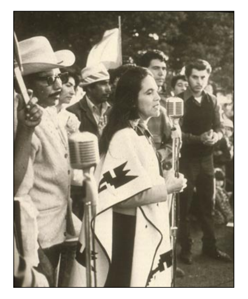
Dolores Huertas was a key leader in the development of the United Farm Workers movement in the 1960s.

The publication of Silent Spring in 1962 catalyzed the new environmental movement, encouraging the more rigorous regulation of pesticides and, through the search for environmentally benign alternatives, encouraging