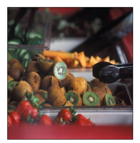
The Community Alliance with Family Farmers' Farm-to-School Project brings fresh, locally grown fruits and vegetables into school cafeterias.

This research was funded by a grant from the University of California Sustainable Agriculture Research and Education Program, and a special allocation from the U.S. Department of Agriculture.