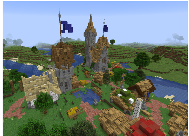
Figure 1: An example settlement generated by AgentCraft, showcasing a variety of buildings connected by roads and built from appropriate materials for the local environment.

Copyright © 2021 for this paper by its authors. Use permitted under Creative Commons License Attribution 4.0 International (CC BY 4.0).