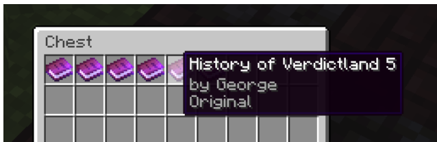
Figure 6: A group of generated Chronicles for a settlement procedurally named Verdictland.

entry this year; consequently, we leave per-agent diary generation to future work.