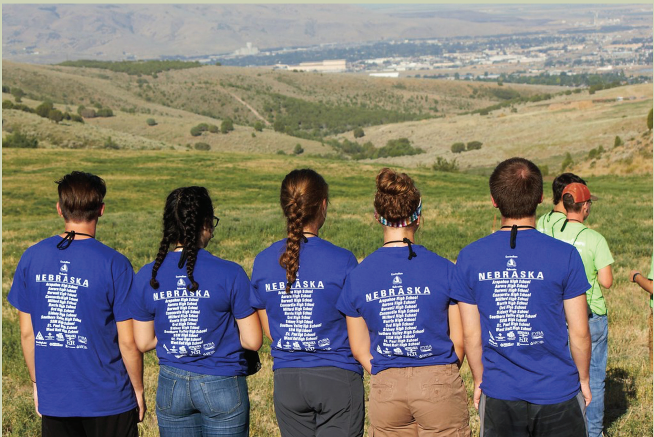
An Envirothon student team ready to engage in place-based learning.

which winning teams from participating US states and Canadian provinces compete for recognition and scholarships by demonstrating their knowledge of environmental science and natural resource management. The program has a strong outdoor component, and is sponsored by the US Forest Service, the US Natural Resources Conservation Service, and others. Much of the field education and field competitions are held in areas protected for their geoheritage and biodiversity values, and this use of geoheritage as a gateway to the broader educational goals is central to the program. The Envirothon's emphasis on both project-based and place-based learning make it a perfect fit for enhancing natural science education in China. By broadening the influence of the Envirothon program and its underlying conservation goals in China, this work provides a platform for project-based learning opportunities and field-based experiences as well as to foster international collaboration.