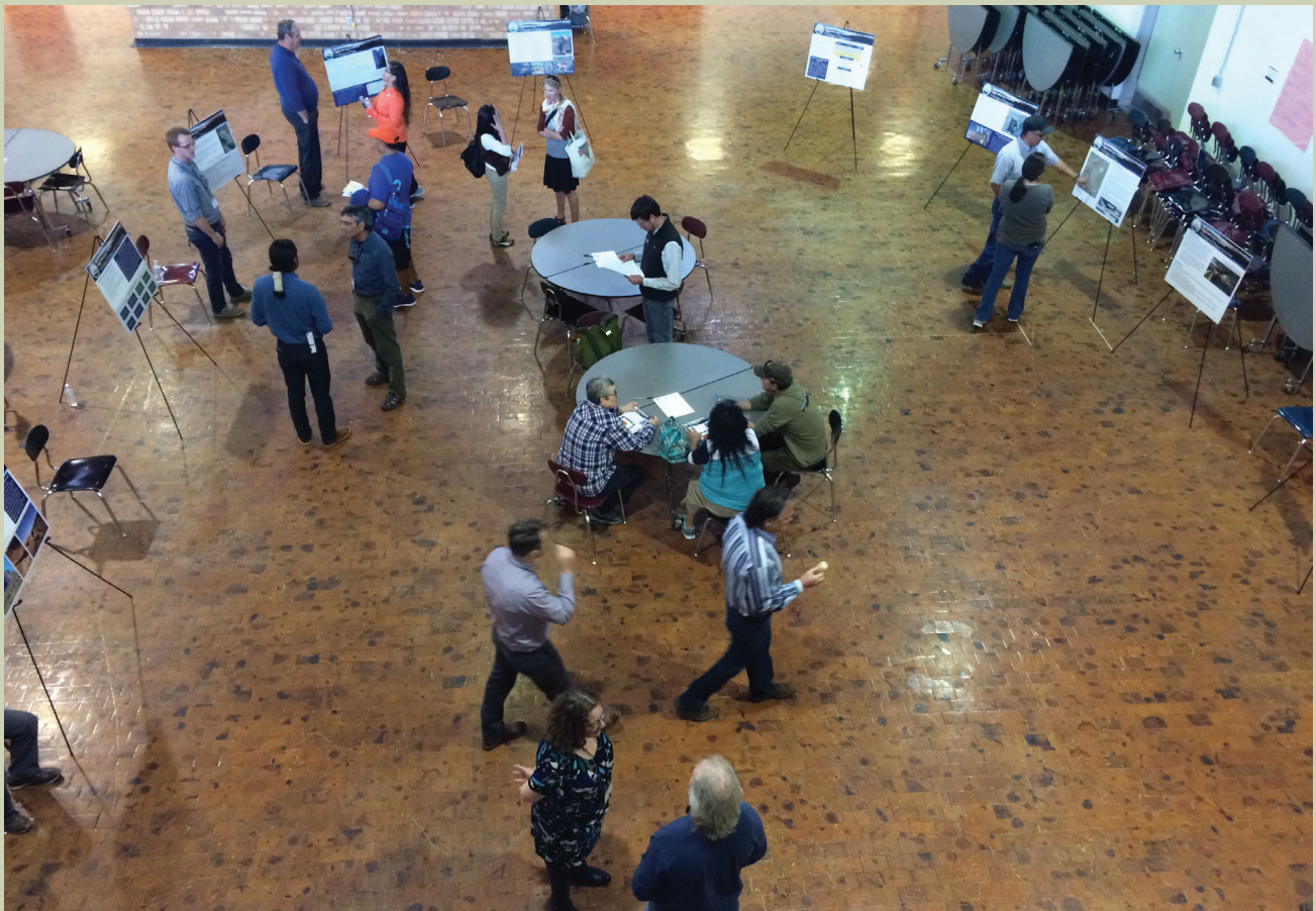
Public outreach in the Navajo Nation.

There are many ways of communicating with people who are visiting protected areas or are looking at a distance, from traditional techniques to the most innovative social media platforms. And there are many different objectives of communication, such as education and knowledge transfer and provision