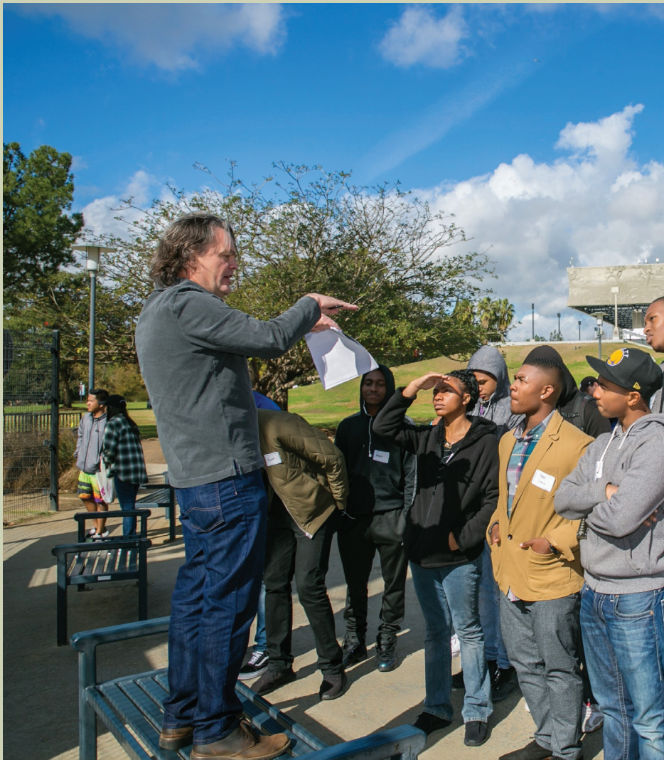
Time travel back to the last Ice Age at the La Brea Tar Pits in Los Angeles, California, USA.

Geoheritage supports a broader understanding of the environment and the stage upon which biodiversity, cultural practices, and climate change adaptation operate. Realizing these multiple benefits depends on building a conservation ethic through effectively communicating geoheritage: helping to interpret geoheritage to interested visitors; providing educational opportunities for those who want to go deeper in their understanding and appreciation; and moving to becoming apostles of a true environmental conservation ethic that includes participating in public outreach and engagement in protected area management. As Jacques Cousteau said: “In the final analysis, people protect only what they love.”