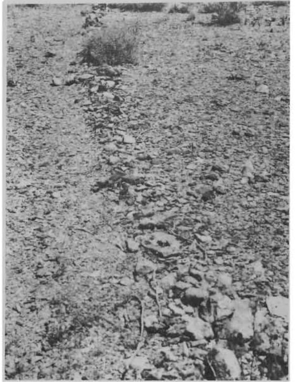
Fig. 3. Rock alignments in Hidden Valley, Nevada.

The lines themselves are very difficult to locate on the ground. They are almost totally indiscernible on the lower portions of the fans which they cross. On the upper parts of the fans, however, they appear as disconnected rock structures of varying width, height, and consistency. In fact, the lines are much more obvious on the U-2 image than they are on the ground surface. Similarly, the lines are more easily seen from a distance, much as a