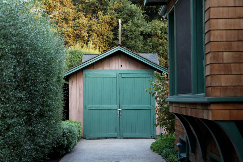
Figure 4: The garage at 367 Addison St. in Palo Alto where Hewlett Packard began in 1939.