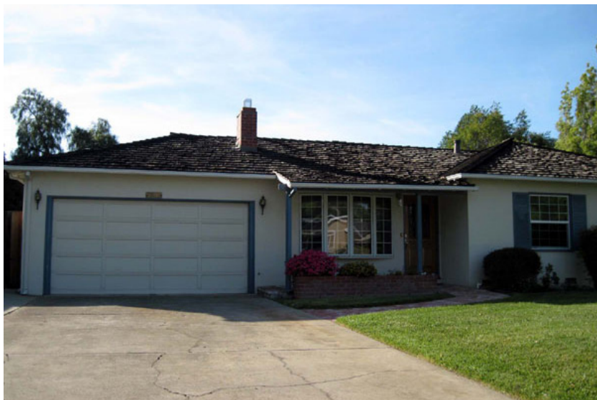
Figure 6: House owned by Steve Jobs' parents at 11161 Crist Drive, Los Altos. Steve Wozniak invented the personal computer in the garage.

where they can later build more permanent and remunerative buildings. These parks are collections of unfinished spaces, usually with roll-up doors and plenty of parking. Although somewhat larger, they play a role similar to that of the garage, providing cheap and flexible spaces that can accommodate any combination of research and development, production, warehouse or office functions.