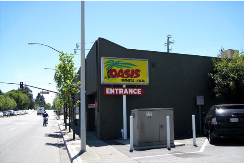
Figure 11: The Oasis, 241 El Camino Real, Menlo Park - one of the valley's hang-outs for inventors and engineers.

groups of unrelated high-tech employees, and Chinese and Indian immigrant families. Conversations in roadside bars and restaurants, like the Oasis on El Camino in Menlo Park or the famous Wagon Wheel in Mountain View, where tech employees met after work to share information, produce synergies that generate new solutions, products and startups. 25 Finally, cheap, easily available workspaces encouraged aspiring entrepreneurs to start new firms with minimal risk.