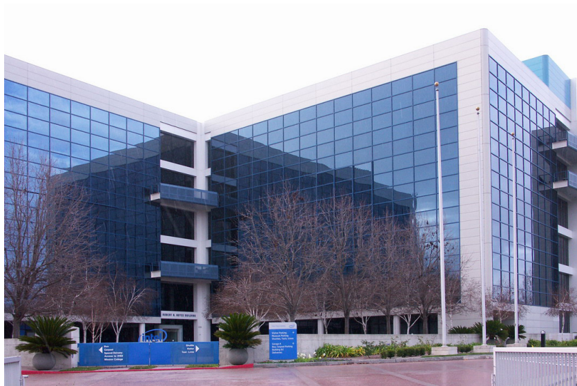
Figure 10: Intel headquarters, 2200 Mission College Boulevard, Santa Clara, houses only management functions, with chip manufacturing done in multiple sites, often offshore.

interaction between engineers led them to change firms or start new firms, a type of intellectual and economic mobility that has produced the continuous flow of startups that guarantee the Valley's continued economic vitality and growth. 23