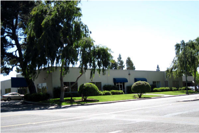
Figure 7: Intel's original building at 365 E. Middleford Road in Mountain View combined production, sales, and research and development.

a two-story building they named “Taco Towers.”