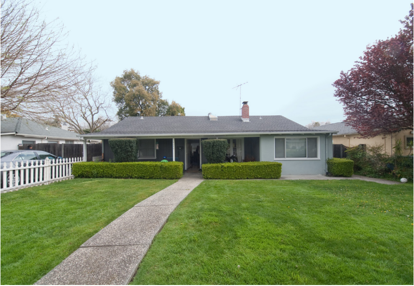
Figure 2: A 1950 “Rancher” in Palo Alto - three bedrooms and one bath, now worth more than $800,000.

edges of the bay. Engineers and other well-paid tech employees were the first wave of settlers, but, after 1965, as in Daly City, immigrants joined them. New arrivals from Vietnam, Cambodia, Mexico and the Philippines found work on expanding electronics production lines, assembling semiconductors, microchips and circuit boards. Their low wages limited their housing choices to new tracts in the Valley’s poorest areas, Mountain View, Alviso and other low-income neighborhoods in San Jose. Even there, high housing costs often forced families to share or double up in houses. 11