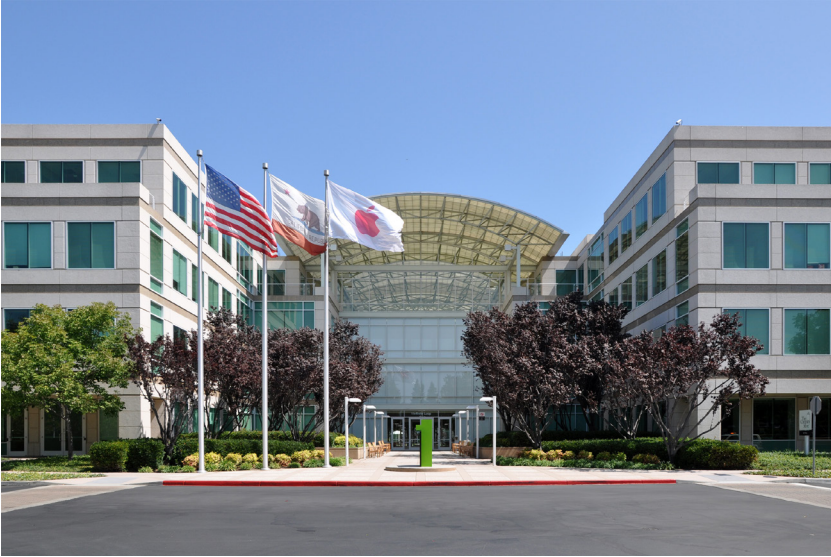
Figure 9: Apple's first campus at 1 Infinite Loop, Cupertino.

globe. High tech outposts can now be found in Bangalore, India, on the outskirts of Beijing near Tsinghua University, and in the numerous Silicon Glens, Forests, and Prairies sprouting up around the world. Easily recognizable by their built forms, which have adopted their aesthetics and typologies from the final stage of Silicon Valley evolution, the sleek, high-end research park, surrounded by greenery, they are usually top-down government efforts. Few, if any, have managed to duplicate the original's dynamic culture of innovation or economic energy.