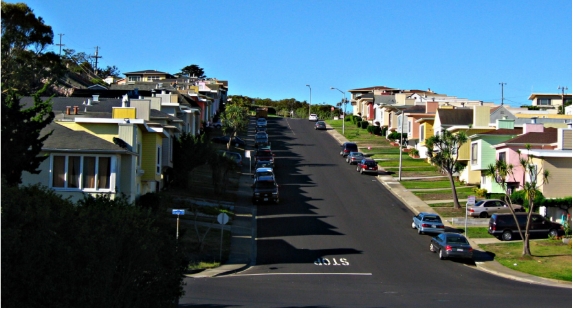
Figure 1: Daly City hillside houses, the “little boxes” Malvina Reynolds wrote about, today.