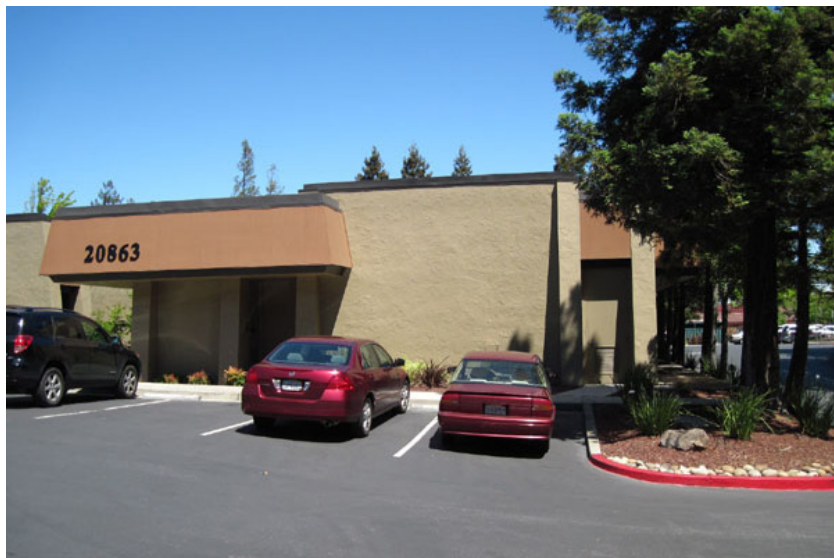
Figure 8: Apple's first post-garage building at 20863 Stevens Creek Blvd, Cupertino.

costs, all of which reduced low-end real estate available for startups. For a brief time during the dot-com boom, Sand Hill Road in Menlo Park was the most expensive commercial real estate in the world. This pushed developers of entry-level office and industrial parks out to cheaper land in San Jose, a city that has replaced San Francisco as the growth pole of Silicon Valley, and its suburbs. 21 In nearby towns, such as Fremont and Milpitas, lacking a prestigious Silicon Valley address, lower land costs encourage new office and industrial parks and their low rents continue to attract startups of all kinds.