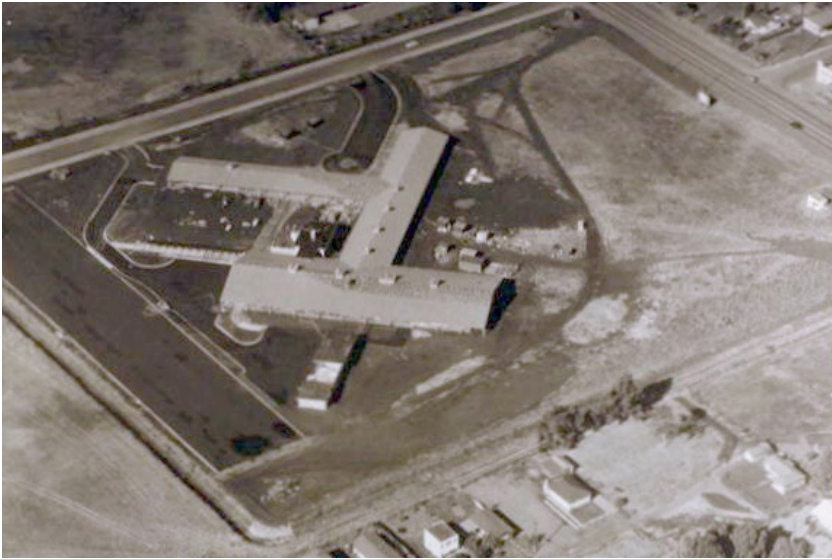
Figure 5: Hewlett Packard's new building in the still unfinished Stanford Industrial Park, c. 1957.

Steve Wozniak among other hackers and IT entrepreneurs. The next year, Wozniak built the first microcomputer in the garage of his friend Steve Jobs' parents' house in Los Altos. Both garages were attached to "little boxes," slightly more expensive than those in Daly City but still affordable for a working class family like Jobs'. 18 These garages have become so legendary in Silicon Valley mythology that they now serve as shorthand for the initial stage of a startup. A recent headline in the San Jose Mercury News' SiliconBeat referred to a new company's expansion as "taking a startup out of the garage." 19