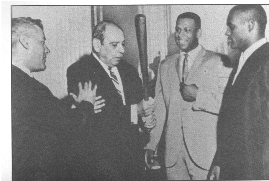
El debate del bate de El Vate

Muñoz Marín's creation, the Constitution of the Commonwealth of Puerto Rico, which went into effect in 1952, can be considered, like Humphries' "Polo Grounds," a poetic act of filial piety. Poetic, or at least fictional, because the document is not a constitution but a program authorized by federal law and subject to revocation at the whim of the United States' congress. In 1993, the U.S. Court of Appeals for the Eleventh Circuit ruled in United States v. Sanchez , a judgment that has not, as far as I know, been overturned,