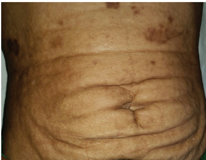
Figure 4. Older sister: Redundant skin folds and increased laxity over the abdomen. PXE lesions tend to develop in a cephalo-caudal fashion starting in late childhood.

They endorsed onset since adolescence. The younger sister also reported severe acneiform lesions on her face since the age of 12. Both sisters had multiple 2 to 5mm round yellow papules coalescing into cobblestone plaques with associated skin laxity. The younger sister's axillary fold demonstrates multiple skin colored papules forming a cobblestone-like plaque, associated with skin laxity and wrinkling ( Figure 3 ). The older sister demonstrated redundant skin folds and increased laxity over the abdomen ( Figure 4 ). The open comedones were limited to the neck in both patients. Both patients noted progressive blurry vision over the past 2 years. However, fundoscopic evaluation was unable to be performed because of a lack of medical resources in the village health clinic. Despite unremarkable smart Tel-based electrocardiograms, the younger sister reported shortness of breath both on exertion and at rest. The patients had four other siblings, but to the sisters' knowledge, no other family member had dermatologic, ocular, or cardiovascular pathology suggestive of PXE.