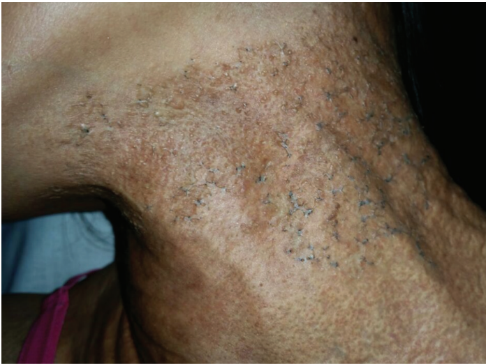
Figure 1. Older sister: Multiple open comedones associated with plaques are an unusual initial presentation of PXE.