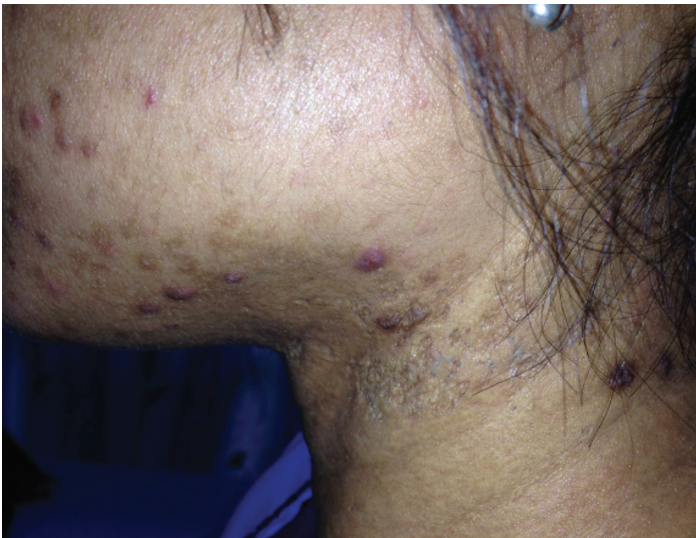
Figure 2. Younger sister: In contrast to her older sister, this patient demonstrates less involvement of the nuchal region. Multiple open comedones are also present and associated with a scar-like plaque.

pathognomonic and diagnostic criteria also require the presence of retinal angioid streaks. Angioid streaks are breaks in the Bruch membrane, which is the elastin-rich tissue layer between the retina and capillaries that supply the choroid. The destruction of this layer leads to central vision loss. Late in the course of the disease, vascular anomalies begin to appear. Mineralization of the internal elastic laminae causes vasculature to break down leading to myocardial and cerebral ischemia and infarction [6]. The morbidity and mortality from PXE are classically a result of cardiovascular complications, such as arterial hypertension, restrictive cardiomyopathy, mitral valve prolapse or stenosis, stroke, and sudden