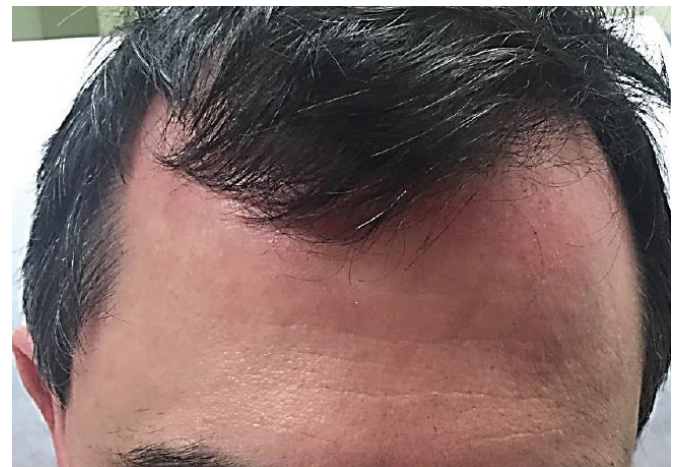
Figure 1. Recession at the frontotemporal hairline, along with an erythematous patch with perifollicular accentuation of erythema from the forehead to hairline.