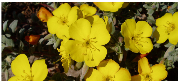
This beautiful beach primrose is a common coastal strand plant, living in the zone between the foredune and high-tide line. David Hubbard