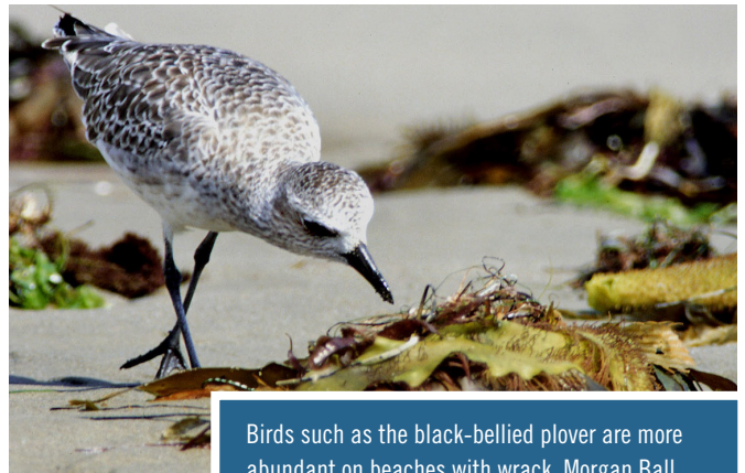
Birds such as the black-bellied plover are more abundant on beaches with wrack. Morgan Ball