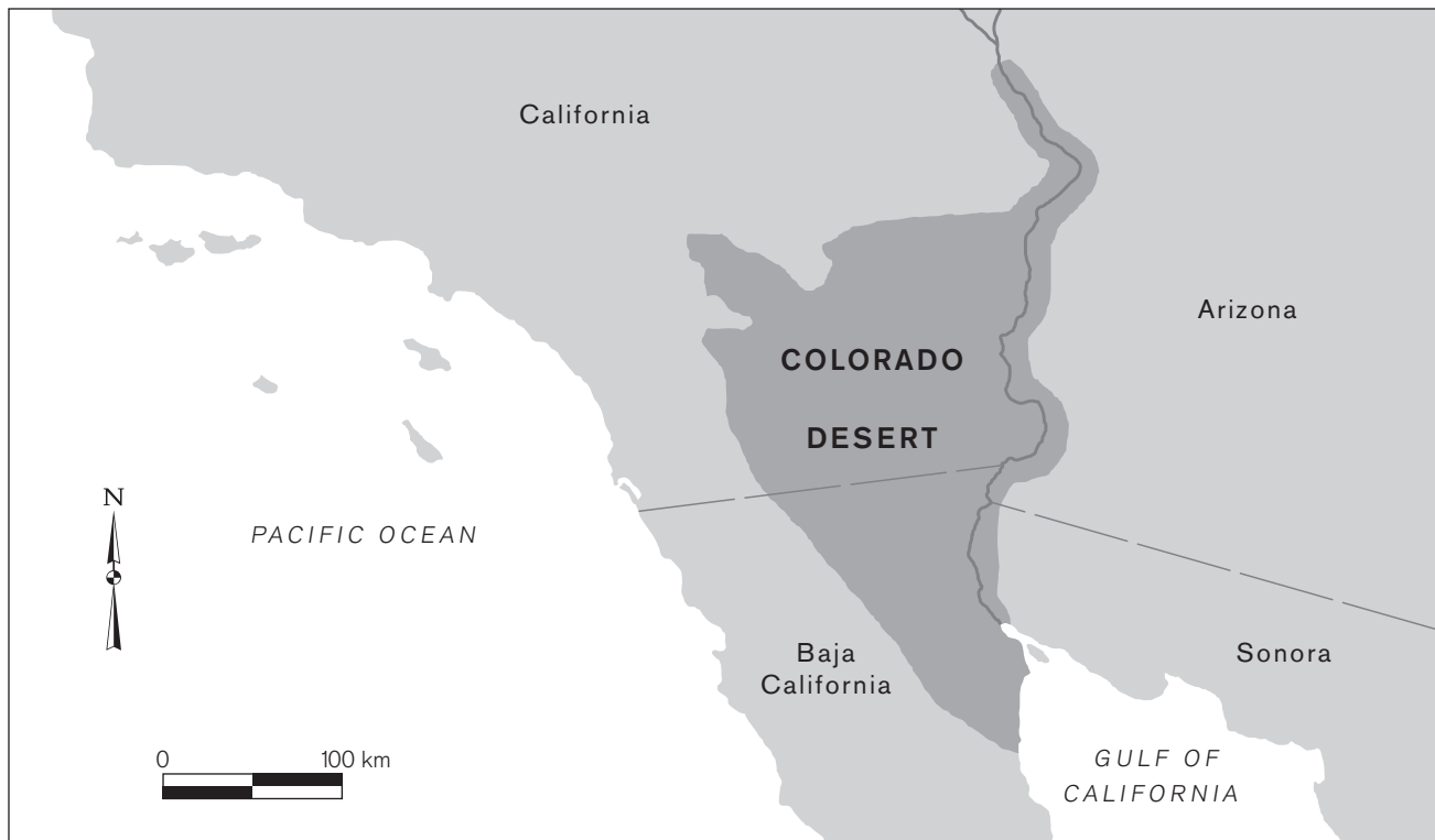
Figure 1. Location of the Colorado Desert.

related or unrelated languages. Nonetheless, it seems fair to say that most linguists consider the genetic model to be generally valid.