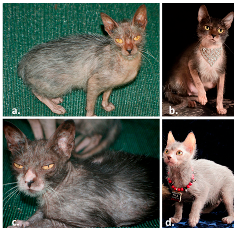
Figure 1. The lykoi cat breed. Lykoi breed founders from independent sightings identified in 2010. (a) Virginia lineage (c.3389insGACA), (b) Missouri lineage (c.1255_1256 dupGT), (c) Tennessee lineage (c.1255_1256dupGT), (d) Canadian lineage (c.2593C>T). Solid black is the preferred coloration as the roaning of the white hairs is more distinctive. Note sparse hair on the lower limbs.

A recently developed breed of cat, termed the lykoi (Figure 1), presents a unique form of hypotrichia [28]. Lykoi have a significant reduction in the average numbers of follicles per hair follicle group as compared to domestic shorthair cats, a mild to severe perifollicular to mural lymphocytic infiltration in 77% of observed hair follicle groups, and the follicles are often miniaturized, dilated, and dysplastic. Individual hairs of the coat are either normal coloration or all white, producing a roaning effect. The undercoats are sparse. Lykoi owners have genotyped their cats for all the known cat fur type mutations, including variants in KRT71 , which cause the hairless sphynx breed, Devon rex [9] and Selkirk rex [11] curly hair, and none of these variants are present in the lykoi cats. The breeding program was established in 2011 by a veterinarian who has constantly monitored health in the cats [29]. No health concerns have been identified in the lykoi other than the lymphocytic mural folliculitis.