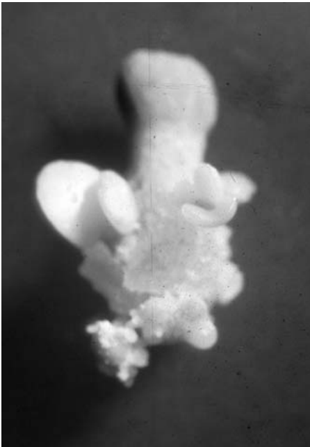
Fig. 1. Citrus embryos from style and stigma cultures.

Following the protocol of D'Onghia et al. (4), flowers were collected before opening and were surface-sterilized by immersion for 5 min in ethanol (70% v/v in water), 15 min in 2% sodium hypochlorite (w/v in water). Stigmas and styles were excised aseptically from flowers, and placed vertically onto Murashige and Skoog (6) semi-solid (7 g/l agar) medium (MS) containing sucrose (146 \mu M), malt extract (0.5 g/l) and BAP (13 \mu M). The pH of the medium was adjusted to 5.7 \pm 0.1 with 0.5 M KOH before autoclaving at 121°C for 15 min. Explants and calluses were subcultured onto fresh medium at 30-day intervals and maintained in a climate chamber at 25 \pm 1^\circ\text{C} under a 16 h day length, and a photosynthetic photon flux of 100 \mu\text{mol m}^{-2}\text{s}^{-1} Osram cool-white 18 W fluorescent lamps. Somatic embryos (2-3 mm in diameter) were isolated from embryogenic cultures (Fig. 1) and germination was attempted in hormone-free MS medium.