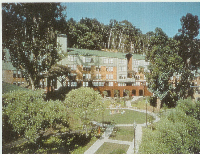
Foothill Housing, University of California, Berkeley